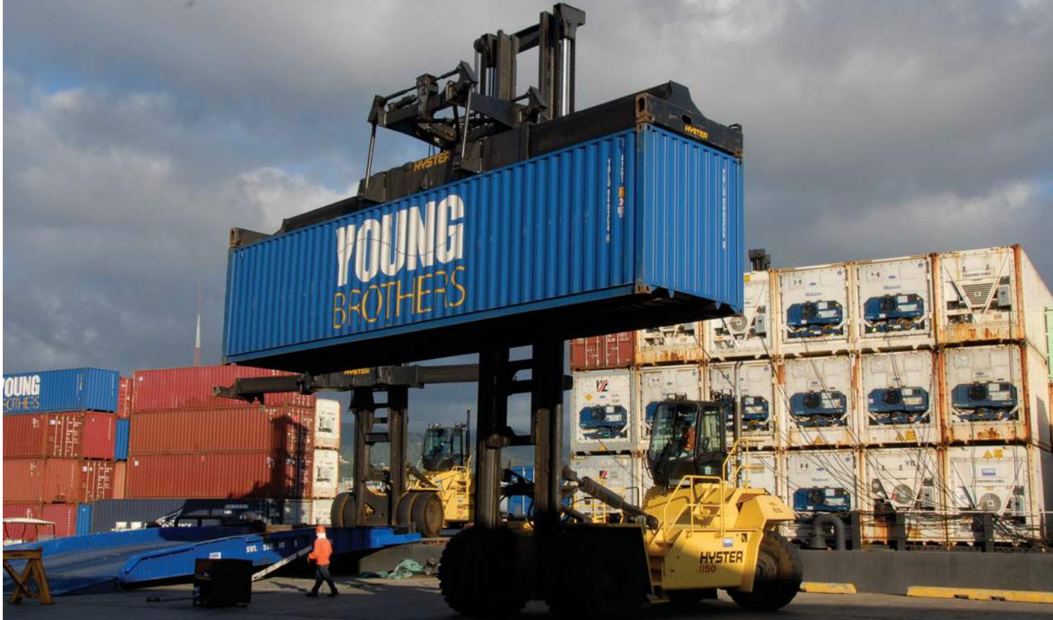
Young Brothers new top-lift machines can stack five-containers-high on the new barges, effectively increasing their capacity by 25 percent.

four-high with Young Brothers' former equipment.