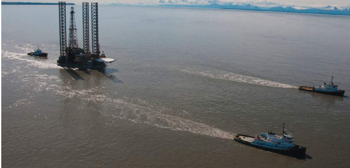
The Tugs Jeffrey Foss , foreground, and Justine Foss , towed the jackup oilrig Spartan 151 into Cook Inlet last August, with the Pacific Explorer trailing. Foss has been rapidly expanding its business servicing the oil and gas industry.