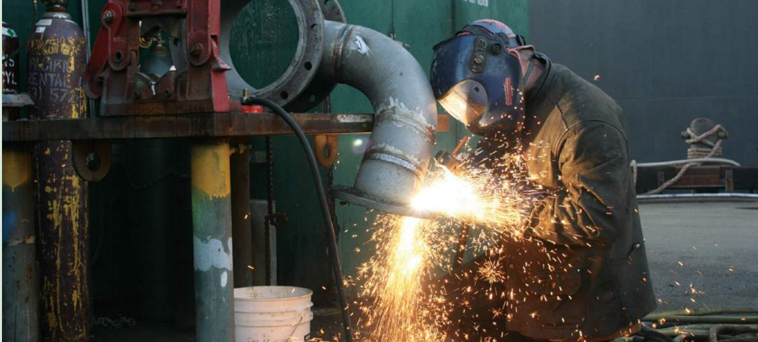
A welder is at work at Foss Shipyard in Seattle. Experienced craftsmen at the yard have expertise in all required skills in vessel maintenance and repair.

finished in 2009, the Rainier yard completed a line handling boat, the Lucy Foss , to work with Chevron tankers in Southern California, and a crew boat, the Ava Foss , for the Chevron operation. A station boat for the San Francisco Bar Pilots, the yard's first commercial project, was finished in 2009.