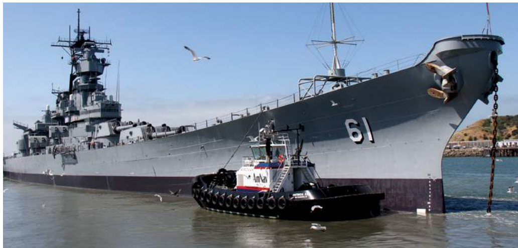
AMNAV recently assisted and escorted the historic battleship USS Iowa from Richmond to sea. The ship will be a floating museum in Los Angeles.