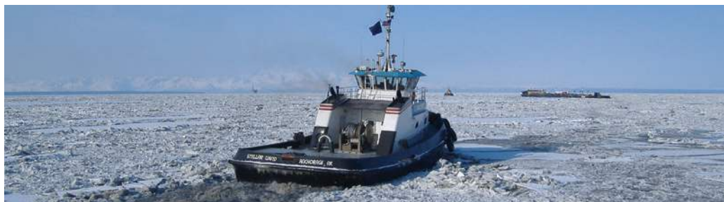
The tractor tug Stellar Wind cuts through the ice Near the Port of Anchorage.