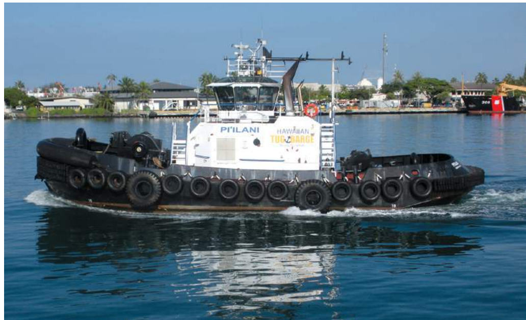
The Pi'ilani is one of two dolphin-class tugs operated by Hawaiian Tug and Barge