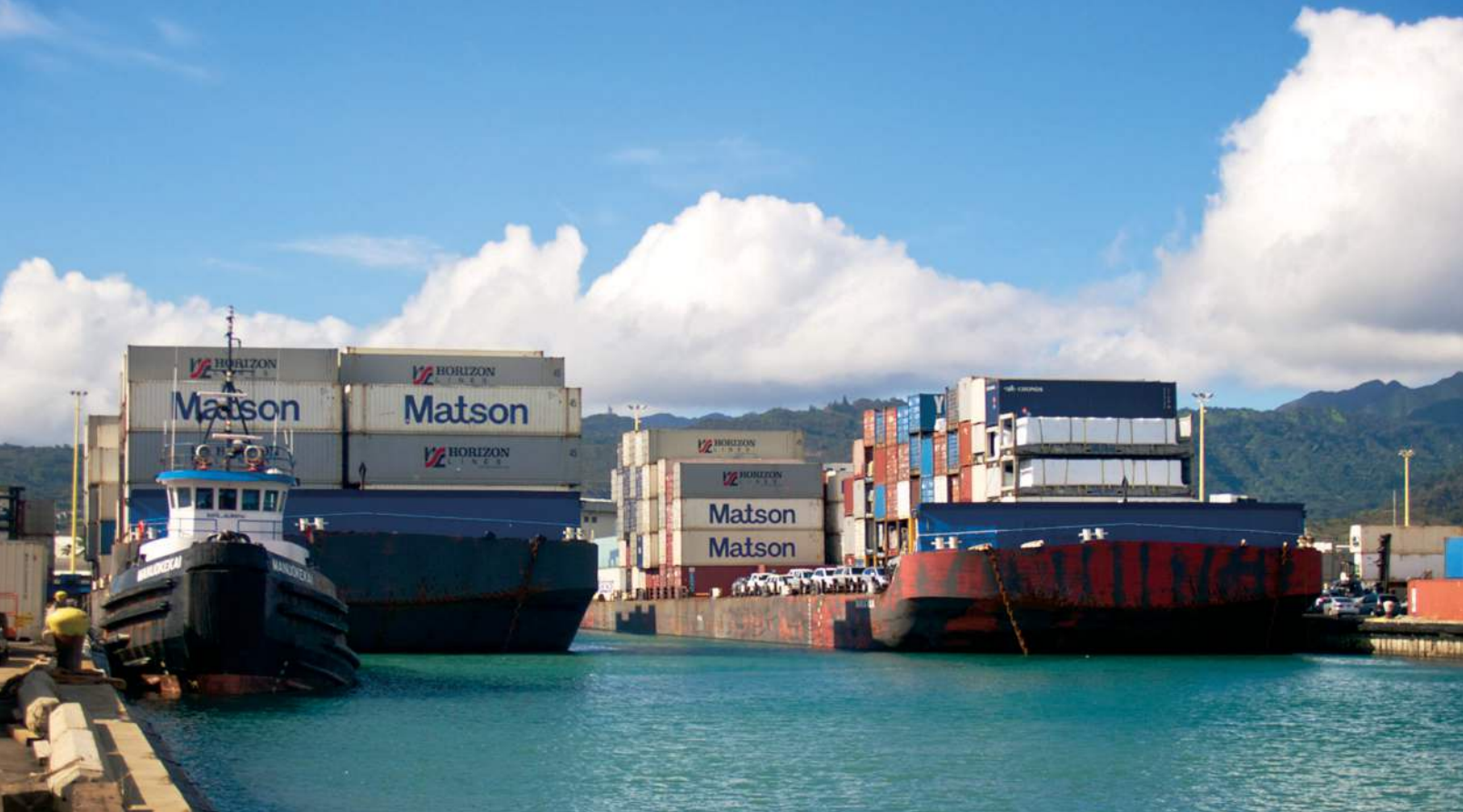
The Tug Manuokekai and two of Young Brothers' four new barges, berthed at the Port of Honolulu.