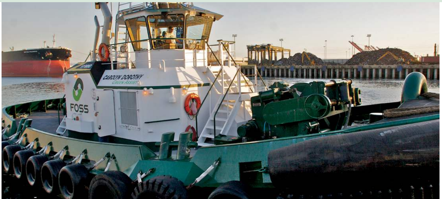
The Carolyn Dorothy , the world’s first hybrid-powered tug, operates at the ports of Los Angeles and Long Beach.