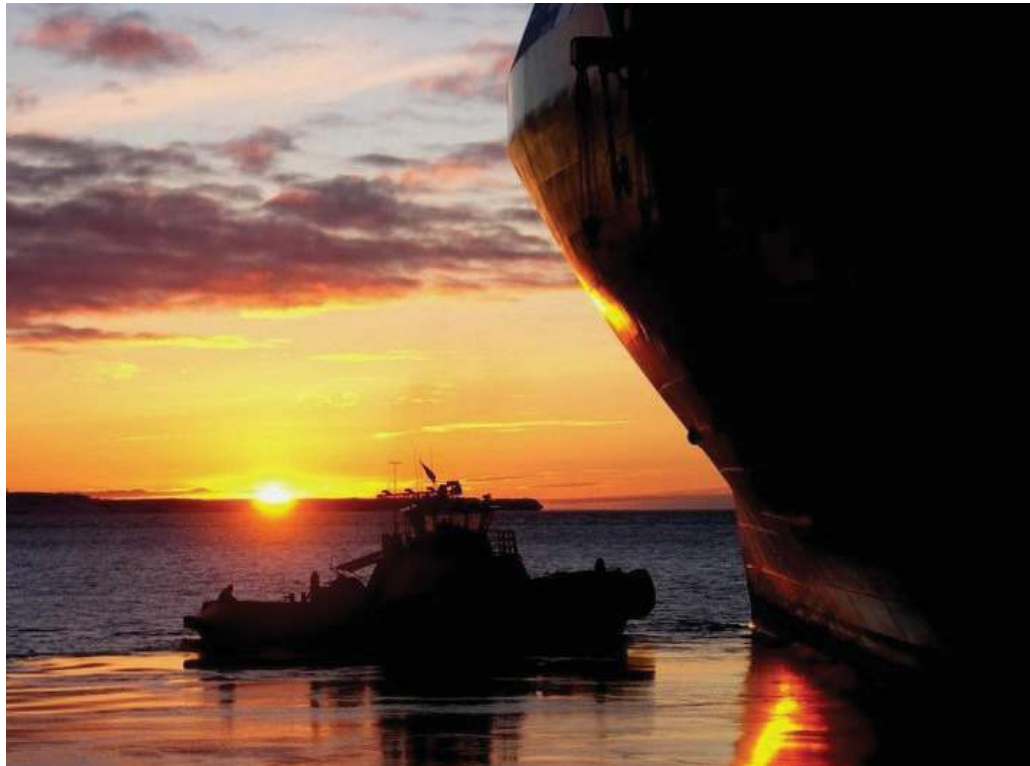
A Cook Inlet Tug & Barge tractor tug assists a containership at the Port of Anchorage as the sun sets over Cook Inlet.