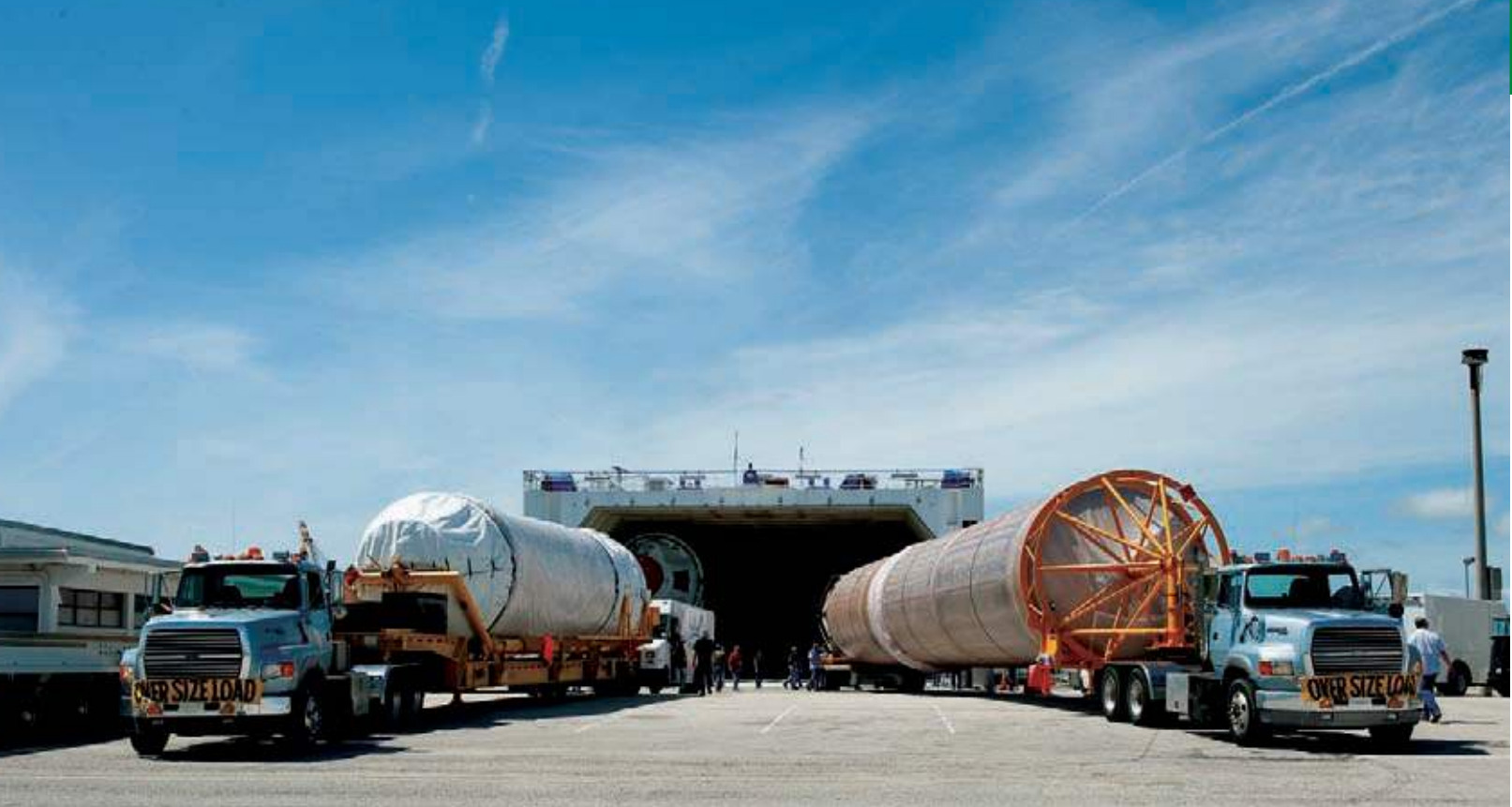
Trucks towed a Delta IV second stage, left, and an Atlas V booster from the cargo bay of the Delta Mariner at Cape Canaveral. Still on the ship is a Delta IV booster.