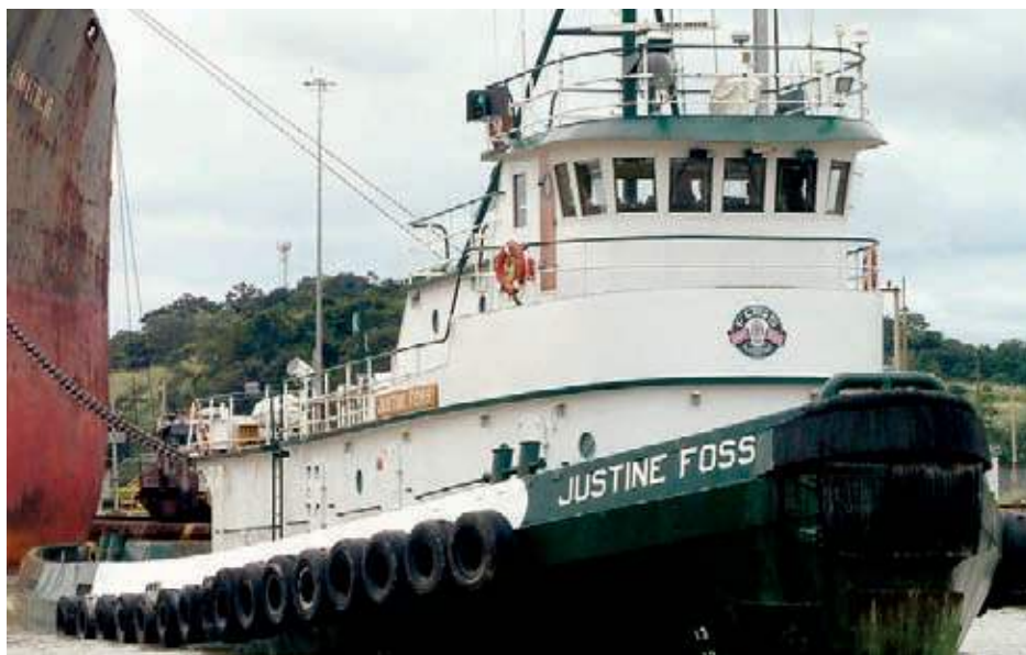
After snagging the “pigtail” chain on the tow bridle of the Brusco Barge 250, the Justine Foss , shown here in a file photo, towed the barge across the Columbia Bar to safety.

The Brusco 250 , a chip barge that was empty at the time of the incident, broke free after its tug, the Triton , experienced a tow winch failure,