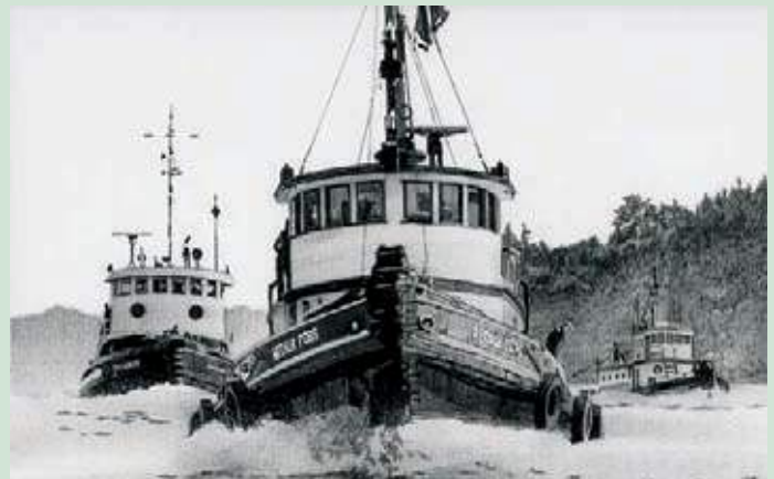
December , Byron Birdsall, Aurthur & Friends Out to Help