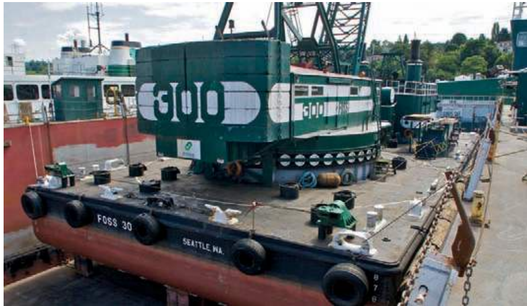
The Foss 300 derrick in drydock at Foss Shipyard in Seattle.

Workers blocked up the barge about six feet off the dry dock floor, just high enough for the wheeled tug to drive the plates into position. Then the plates were jacked up and welded into the barge hull. A conventional forklift's masts would be too high to fit