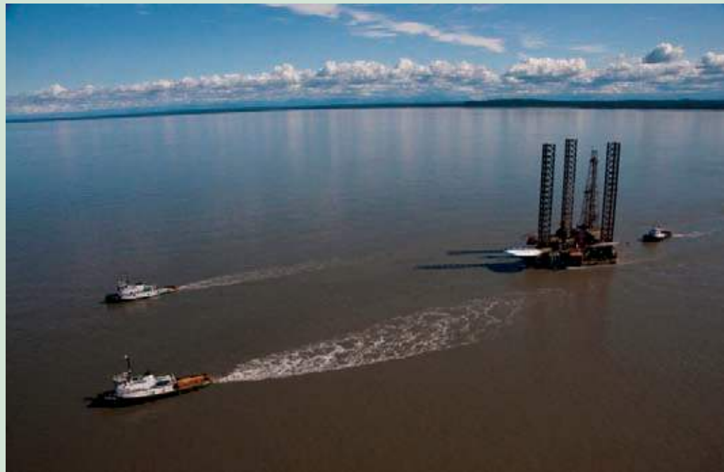
The tugs Justine Foss , left foreground, Jeffrey Foss , above the Justine , and Pacific Explorer brought the jack-up oilrig Spartan 151 into Cook Inlet, passing Nikiski, Alaska, on August 10

Foss parent company MRG chartered the Green Provider , shown near Nikiski, to service the Spartan 151