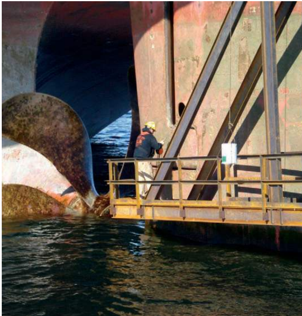
Jason Yearance of Foss works on the scaffolding used by a crew from Hyundai to repair a rudder bearing on the LNG tanker. Two members of the Hyundai crew crawled through the hole in the rudder to repair the bearing.

"Our goal was to dampen the effect of swell while transferring the load between two vastly different vessels,"