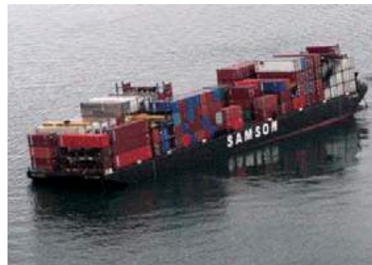
The barge St. Elias , aground on Belle Rock.

Global Diving and Salvage inspected the barge and found significant damage to one tank. On the incoming tide the barge floated free and was taken to Ship Harbor near Shannon Point for a dive survey. After Global evaluated the video from the dive survey with the Coast Guard, Foss worked collaboratively with Samson, Global and the Coast Guard and prepared a detailed transit plan to safely move