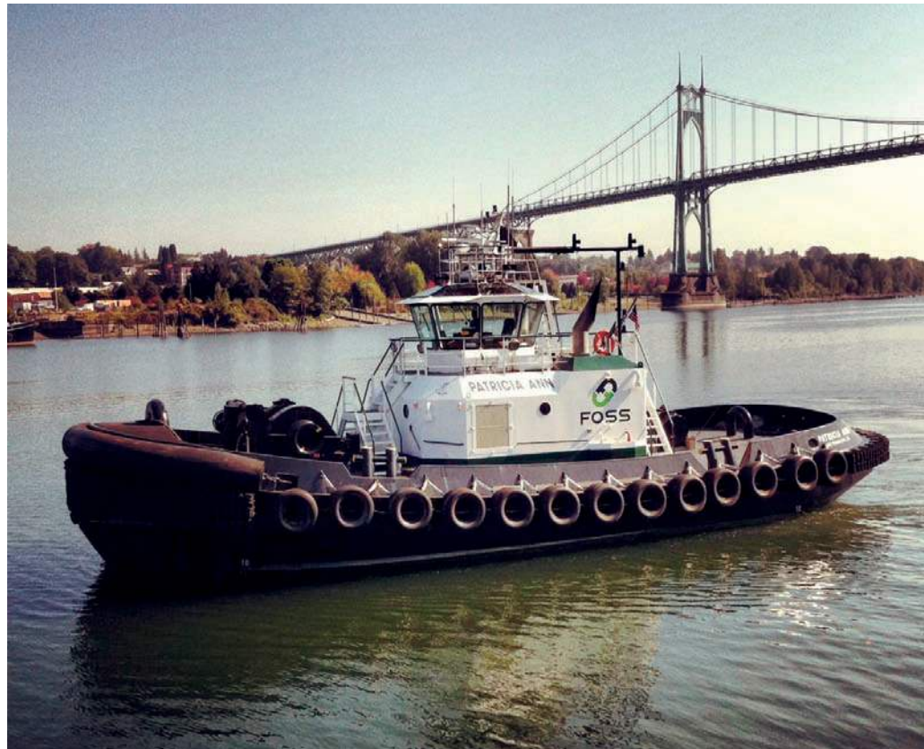
The Patricia Ann , sports its new Foss paint job on the Willamette River in Portland. The St. Johns Bridge is in the background.