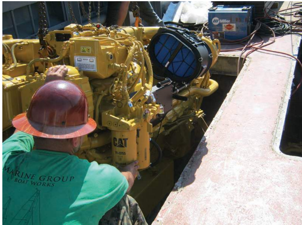
A worker at Marine Group Boat Works in San Diego guides an engine through the deck of the Piper Inness .

Each engine weighed 1,200 pounds more than the old ones, so new stability and deadweight surveys were