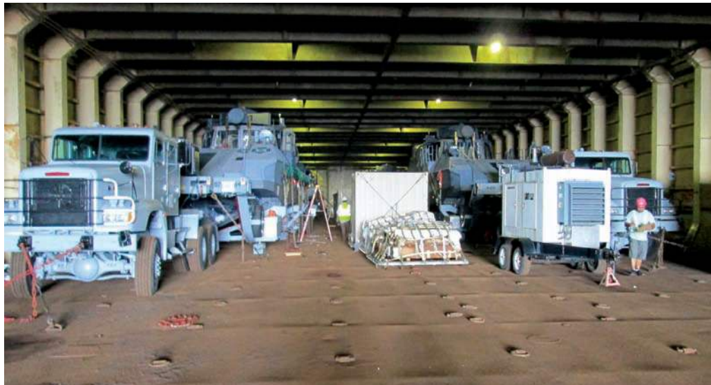
The Mark V boats, along with their tractors and trailers, are lashed in the covered area of the ATB.

International's other ATB, the Strong Mariner , feature covered barges with unique clamshell style openings that enable cargo to be ramped in from the bow.