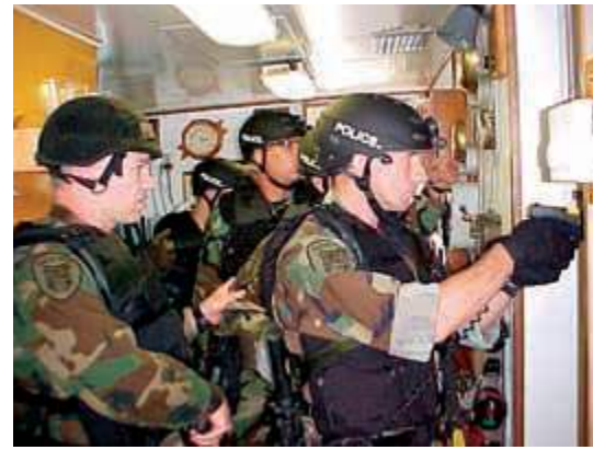
Seattle Police SWAT Team members search a cabin on the Justine Foss .

The drill also gave the team members a chance to practice several techniques for boarding vessels.