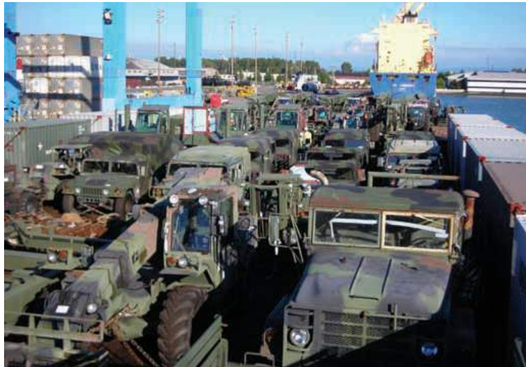
The Foss 343, at Berth 7-C at the Port of Tacoma, is loaded with cargo the U.S. Army will use to support port operations in Korea.

The conversion included removal of six tractor-trailor loads of bark debris.