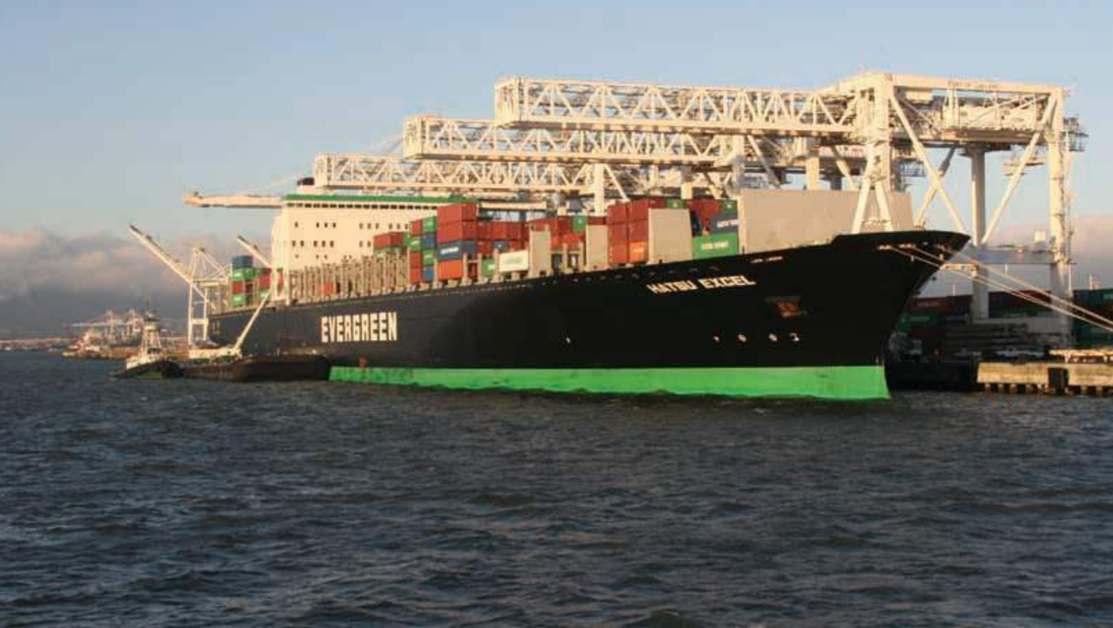
The FDH 35-1, one of the new double-hull barges on San Francisco Bay, delivers oil to an Evergreen ship at the Port of Oakland.