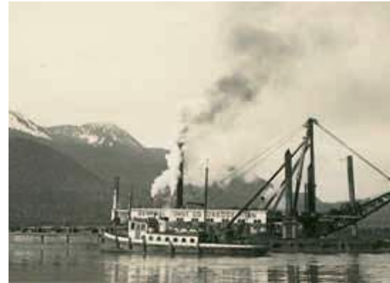
The Justine Foss , at work for General Construction in Juneau, Alaska, in 1939.

ments stretching from Southern California to Kodiak Island, Alaska. When not on the coastal assignments the Justine was equally at home towing chip barges and logs on Puget Sound waters. The Justine was lost at Wake Island in the Western Pacific in December 1941 while working for the U.S. Army Engineers.