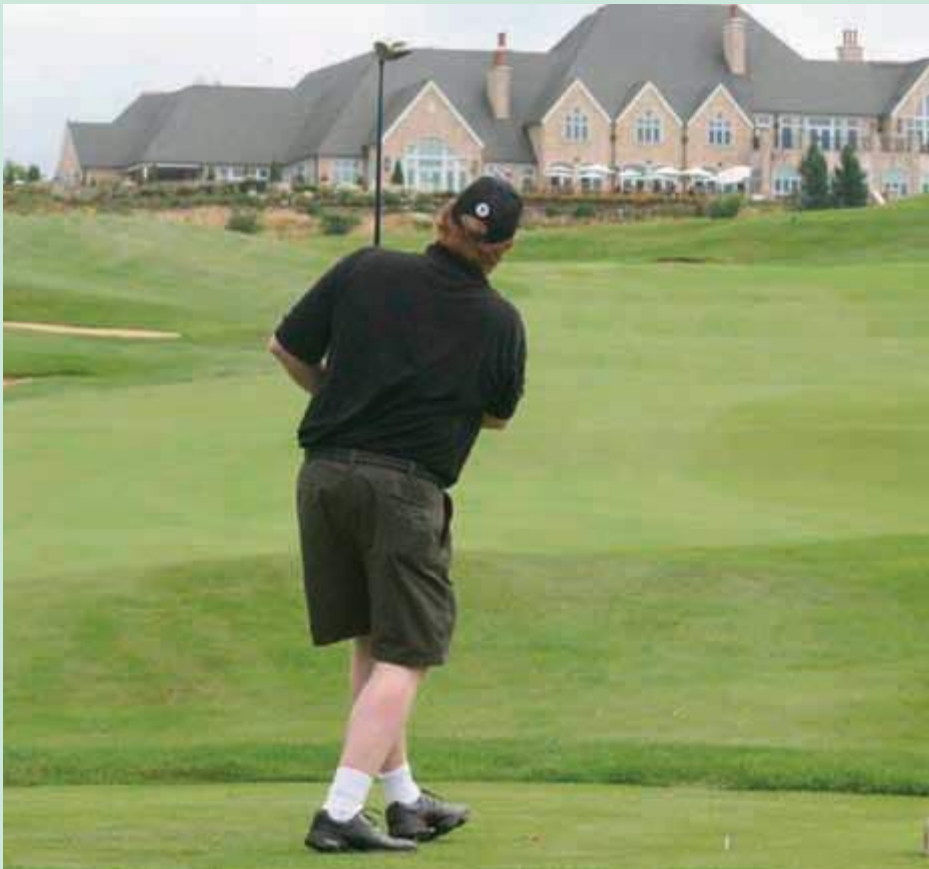
A Towboat Open Invitational golfer hits a tee-shot. The Golf Club at Newcastle is in the background.