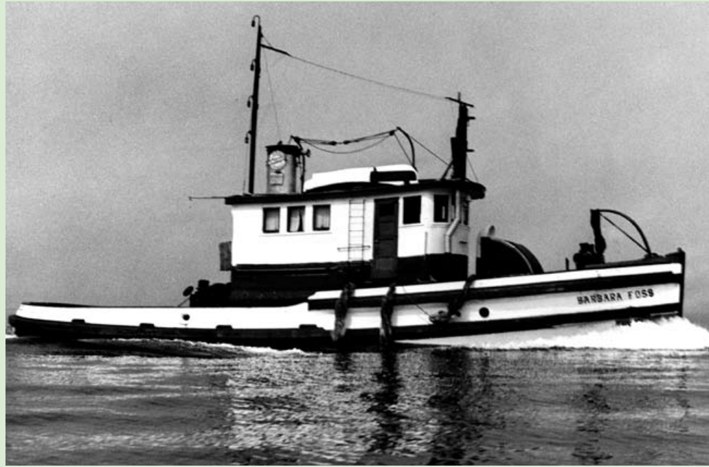
The tug Barbara Foss burned and sank after a fire flared up in the engine room on March 31, 1942.

“Please make a careful inspection throughout your vessels and eliminate all possible fire traps, following this by periodic inspections to maintain the highest possible standards. Our port engineers will assist you in every way possible and discuss with you any