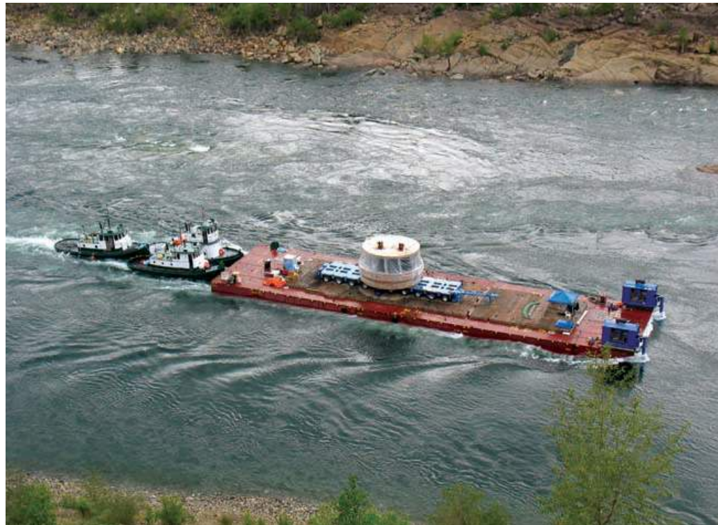
The Foss convoy passes a rapid on the Columbia River near Northport, Wash., just south of the Canadian border.

After crossing the border, the boats passed Waneta Dam, where the Pend Oreille river flows into the Columbia, then traveled stretches of narrow river below, between and above the Arrow Lakes before arriving in Shelter Bay, where the turbine was unloaded at a ferry landing. It was carried from there over land to the hydro plant by a prime mover.