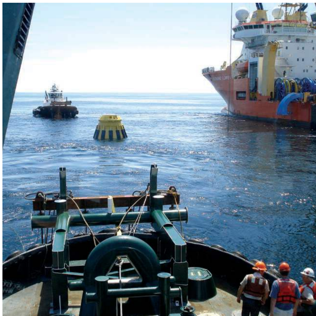
The tractor tugs Orion , in the foreground, and Leo hold mooring wires in place at the LNG terminal site while the wires are attached to anchor chains by a submersible vehicle. Between the two tugs is a 200-ton buoy, which will be submerged, serving as both a mooring for ships and a conduit for their cargo.

“This is the first time APL has used a submersible to connect the cables to the anchors on the sea floor,” Manning