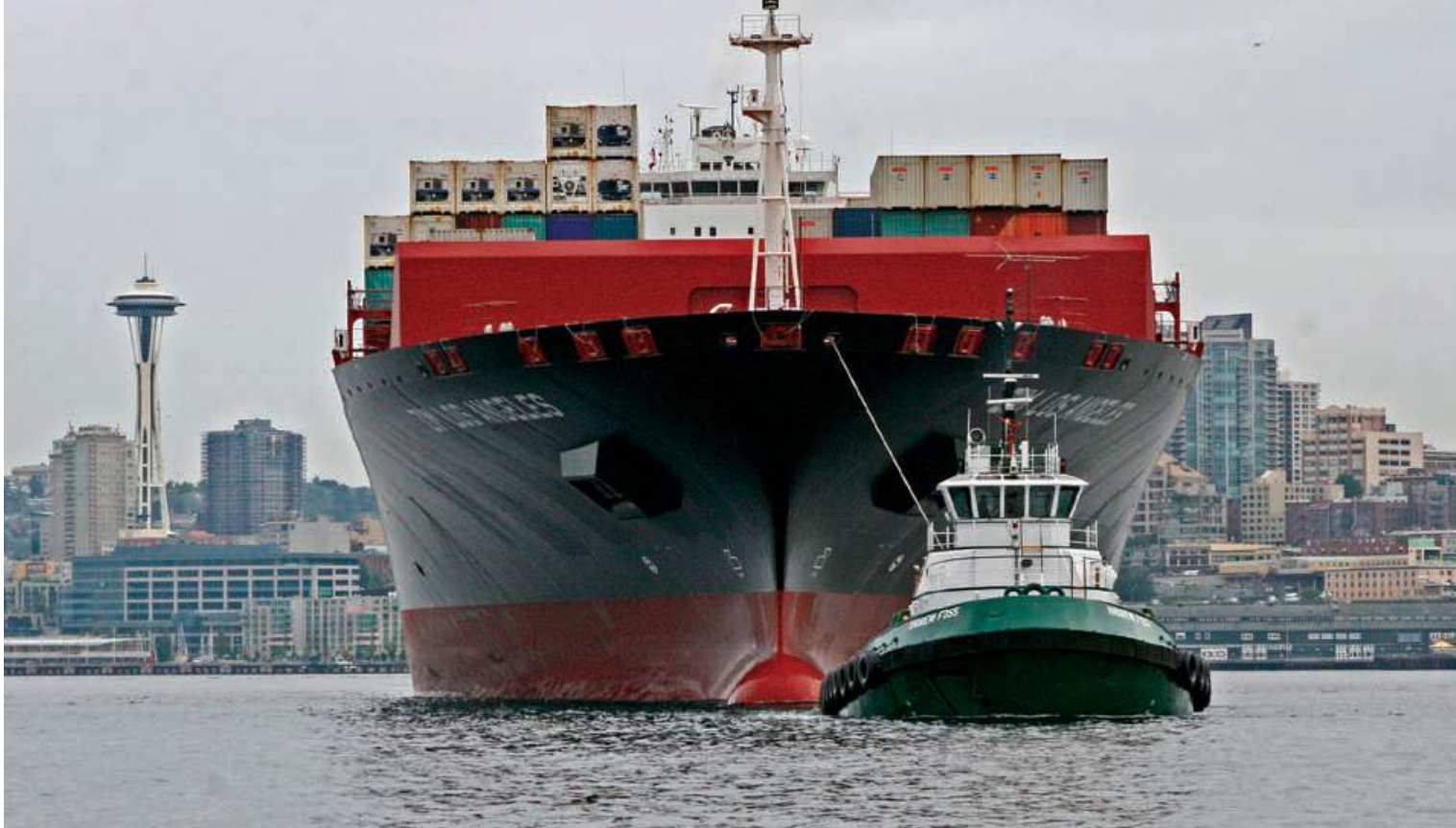
The Zim Los Angeles , inaugurated the new Zim service to the Pacific Northwest with its maiden voyage to Seattle on August 12. The 8,500 TEU containership was led into its berth at the Port of Seattle's Terminal 18 by the Andrew Foss .