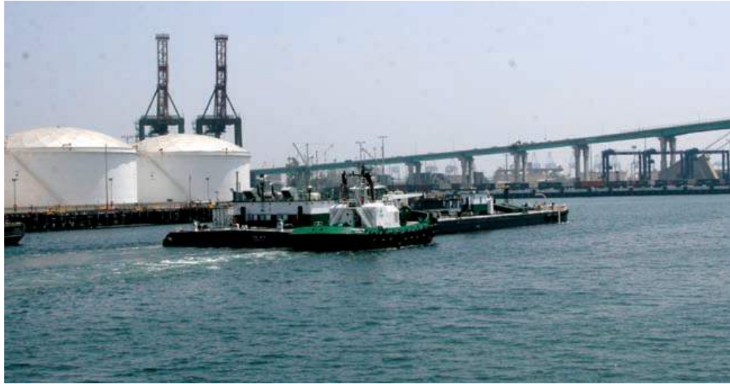
The FDH 35-3 , guided by the Campbell Foss , moves down a waterway at the Port of Los Angeles.

And the Series 60 Detroit Diesel engines used to pump oil aboard ships meet Tier 3 environmental standards that won't go into effect until next January.