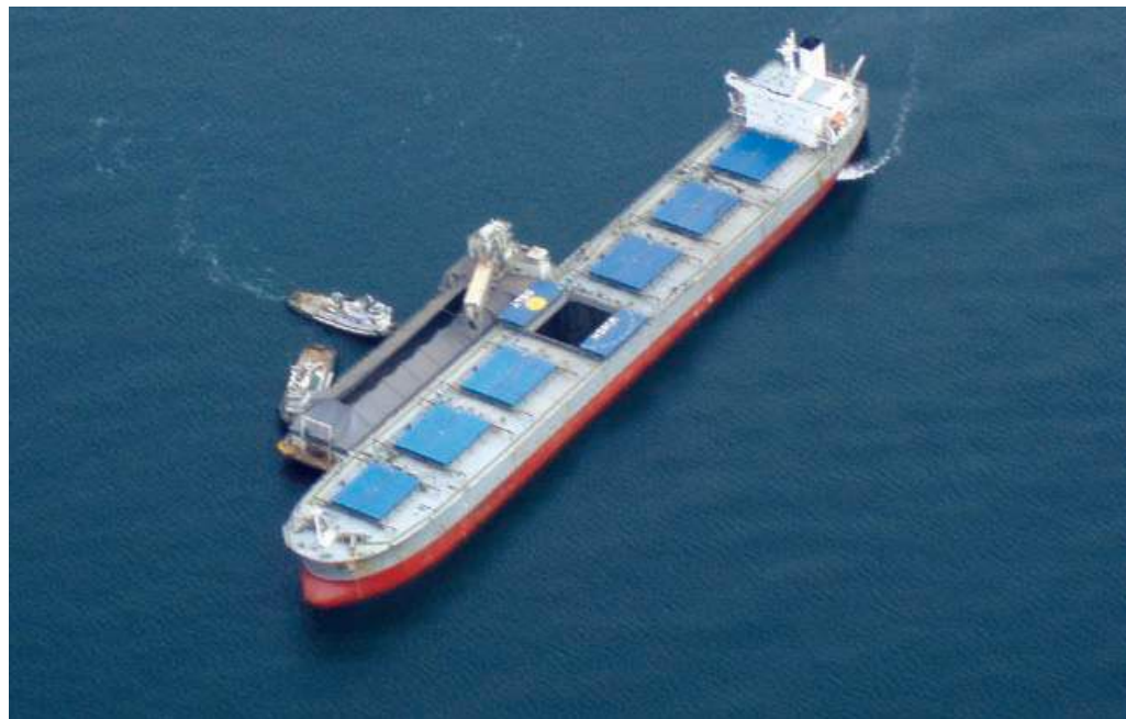
The Sandra Foss , left, the Jeffrey Foss and the barge Noatak load a ship at the Red Dog anchorage.