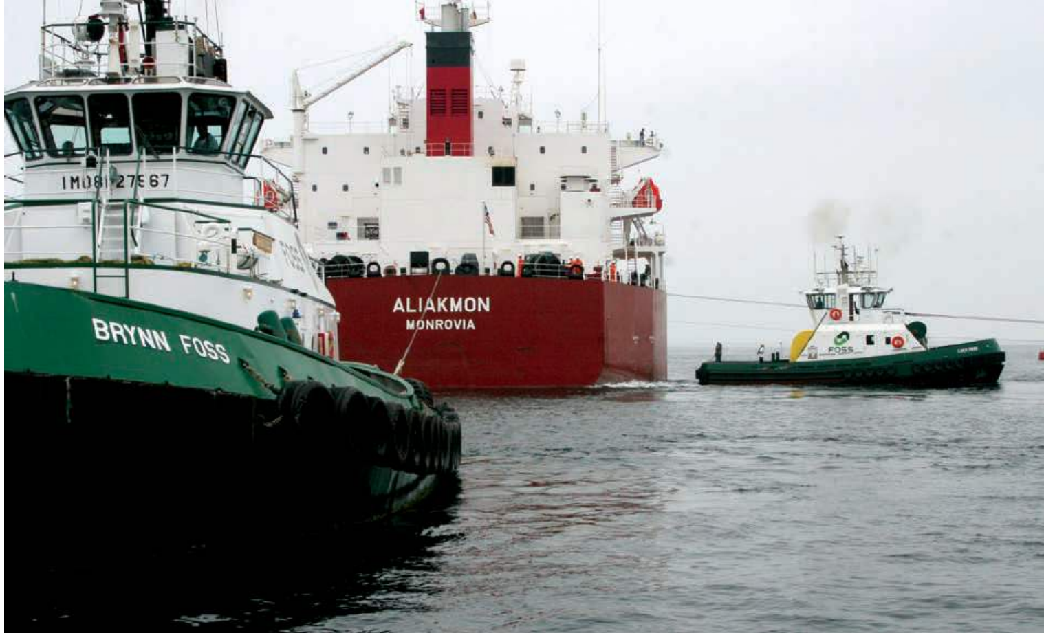
The Brynn Foss holds the tanker in position, while the Lucy Foss approaches the ship to fetch a mooring line.

of how the alliance enables both Chevron and Foss to provide input on operational requirements, which can then be passed to Foss engineers and naval architects to develop a boat.