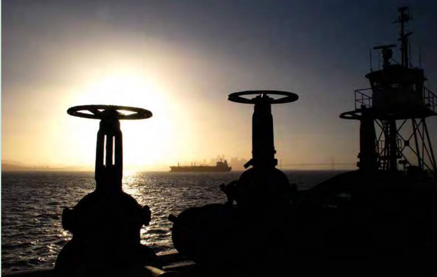
Sunset during bunker transfer at Anchorage 9