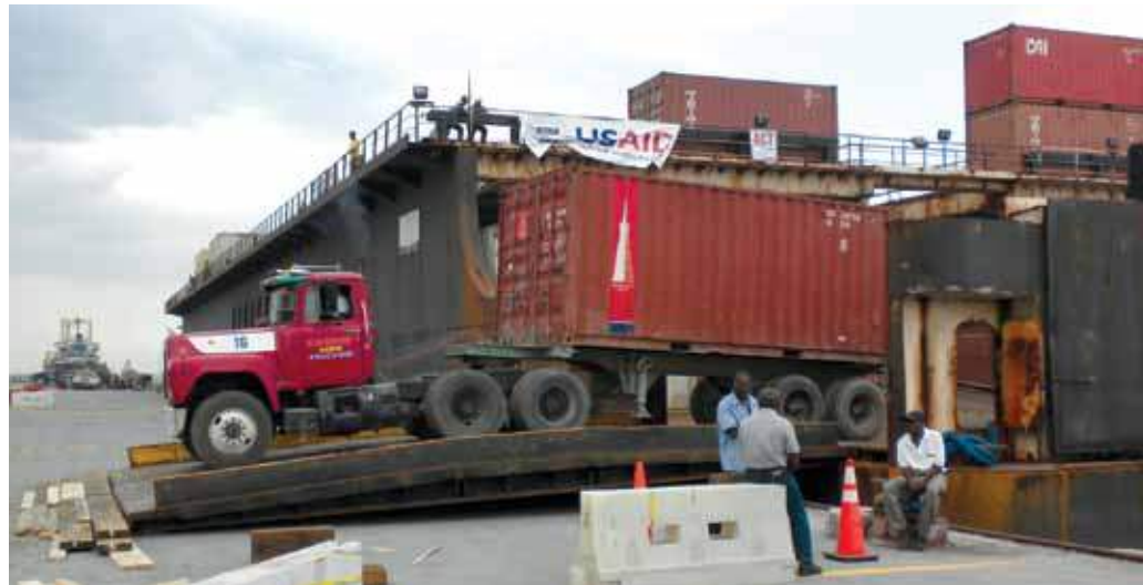
Containers of food aid cargo come off the ACTC barge American Trader in Port au Prince.

Simultaneously, ACTC provided the U.S. military's Southern Command with up to four sets of dedicated ocean tugs and barges. ACTC provided a dedicated tug and barge for use between Guantanamo Bay and Haiti as well as other sets for deliveries