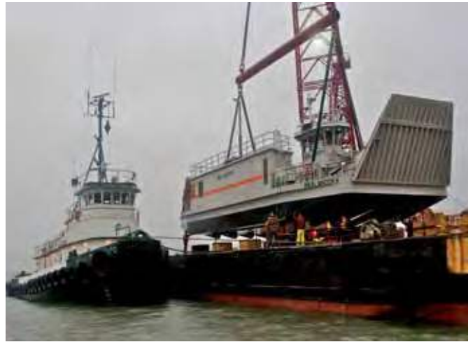
The Sidney Foss holds a barge in position while the ferry Real McCoy II is loaded.