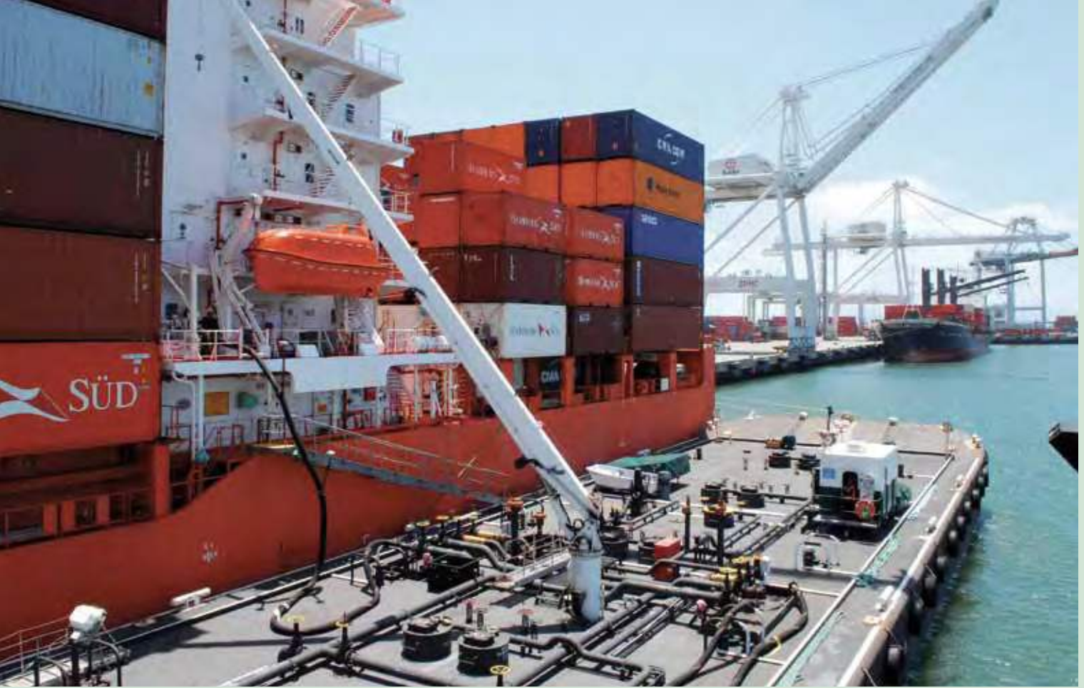
Bunkering a container ship at the Port of Oakland.