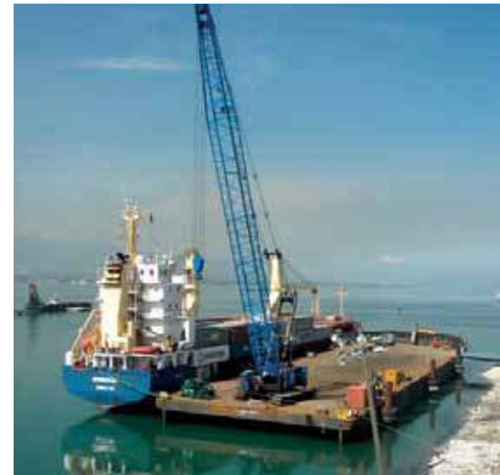
The Foss barge Columbia Boston was set up by ACTC as a temporary cargo terminal in Port au Prince

ACTC is no stranger to the food aid business, regularly delivering government cargo to countries in the Caribbean, Central America and Africa. It also has assisted relief efforts following natural disasters, beginning with Hurricane Mitch in Honduras in 1998.