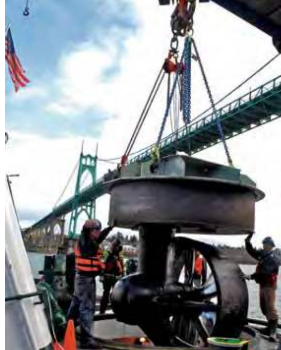
Workers at Advanced American Construction install a rebuilt Z-Drive in the tug PJ Brix . The tug remained in the water for the job.