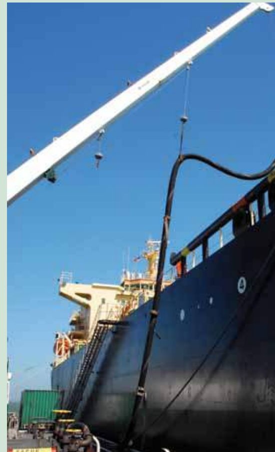
Starting a bunkering job at Anchorage 9.