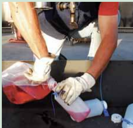
Harold Presswood takes a clean diesel sample to send to a test center for inspection.