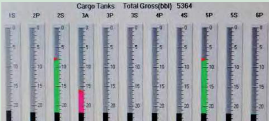
Tankermen keep a keen eye on their computer gauges that monitor the levels in each tank on the barge.