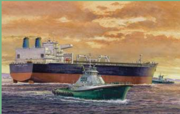
September , Gene Erickson, Alaska Bound