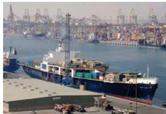
The Tote ship Great Land docked at Jebel Ali, United Arab Emirates.

The principal customer is the U.S. Army's Surface Deployment and Distribution Command. Cargos include new armored HMMWVs (humvees) and MRAP armored fight-