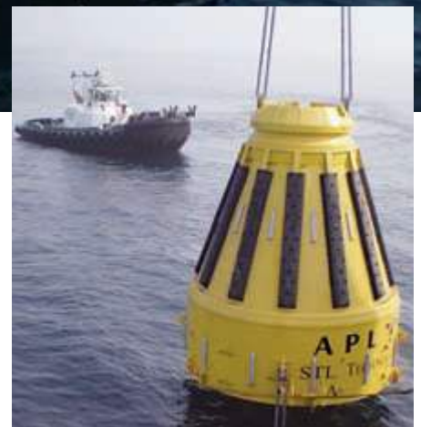
The Leo stands by as a subsurface buoy is lowered into the water.

“Hopefully, we can make another contract with Constellation.”