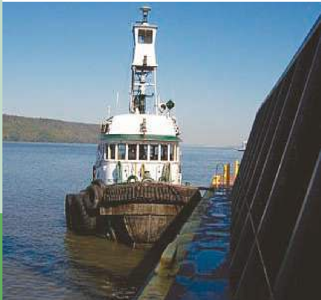
The David Foss pushes a barge in the Hudson River near the George Washington Bridge.

Expansion-minded Foss bought Constellation Maritime last year, giving the company its first outpost on the East Coast.