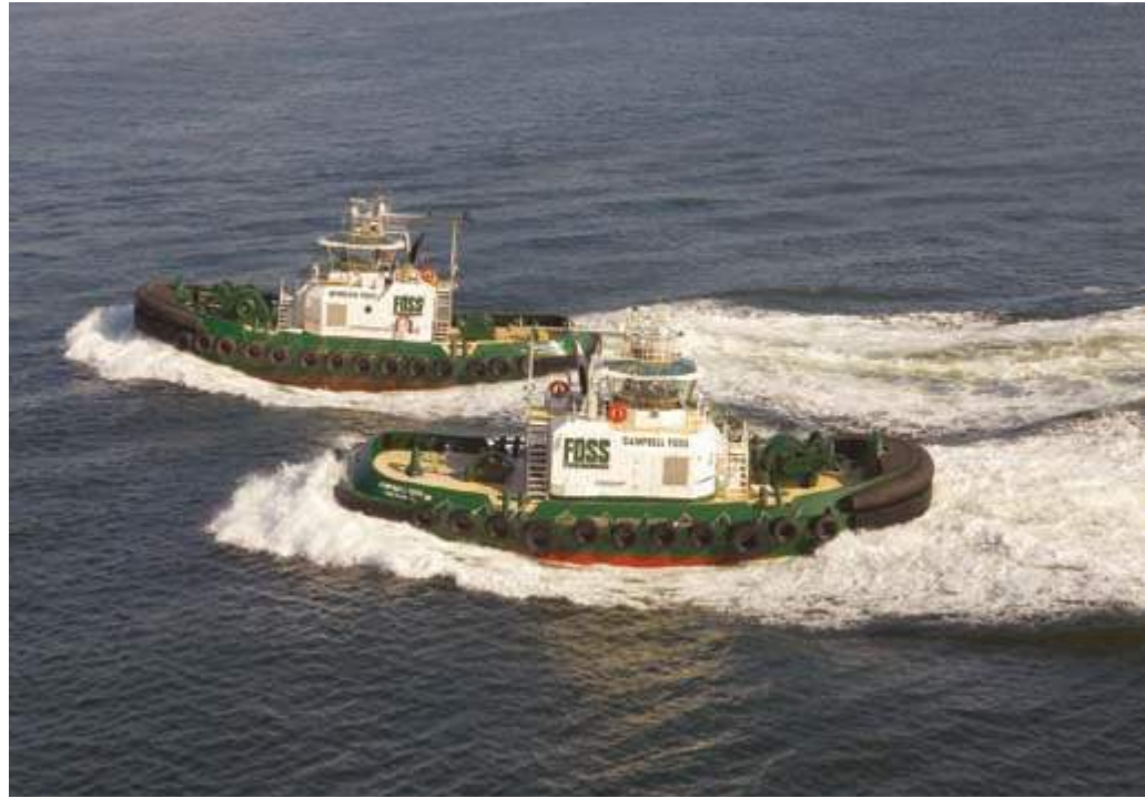
Foss' twin Dolphin-Class tugs in Southern California, the Campbell Foss , foreground, and Morgan Foss .

The design requirements are different for boats that assist ships in