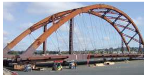
The Sauvie Island Bridge span at Terminal 2 in Portland, ready to be moved by Foss