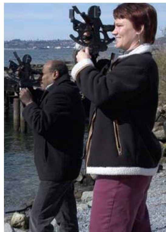
Cadets practice with sextants as part of their training at Pacific Maritime Institute. Those in the photo will work for companies other than Foss.

uses the internet to recruit more than a million drivers a year.