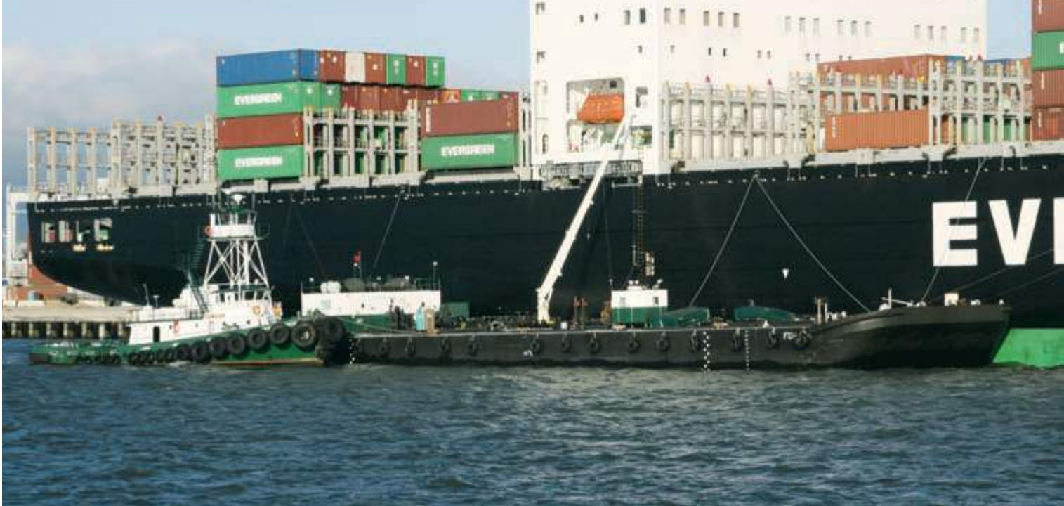
The tug Point Vicente , with its new pilothouse tower, assists one of Foss' new double-hull tankbarges, the FDH 35-1.