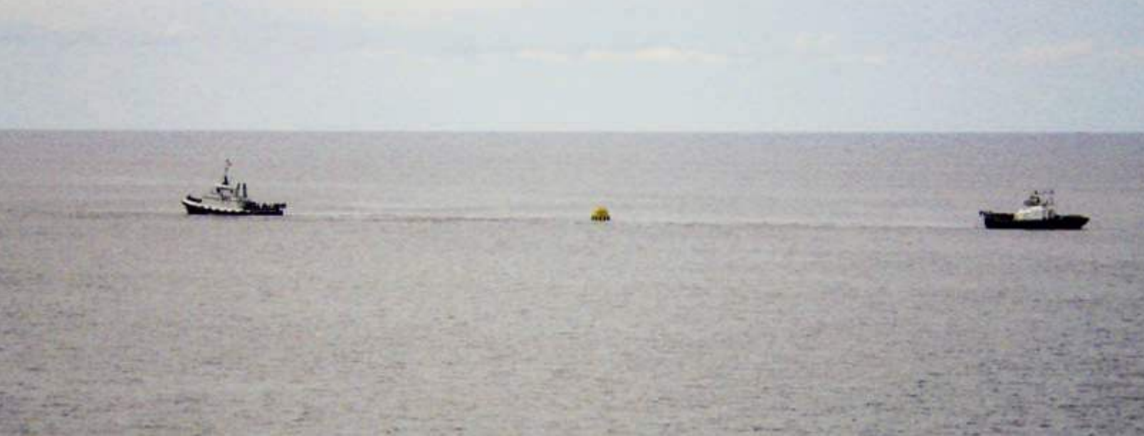
The tractor tugs Orion , left, and Leo maintain tension on the anchor lines attached to the subsurface buoy.