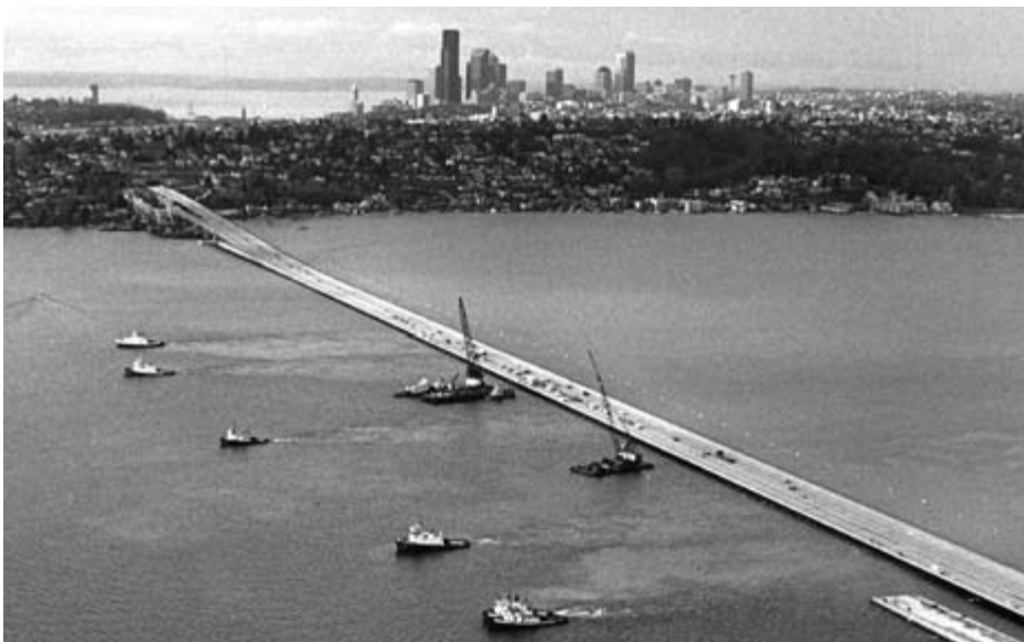
Floating bridge sinking meant anything but a holiday for Foss tugs and personnel in 1990 on Lake Washington