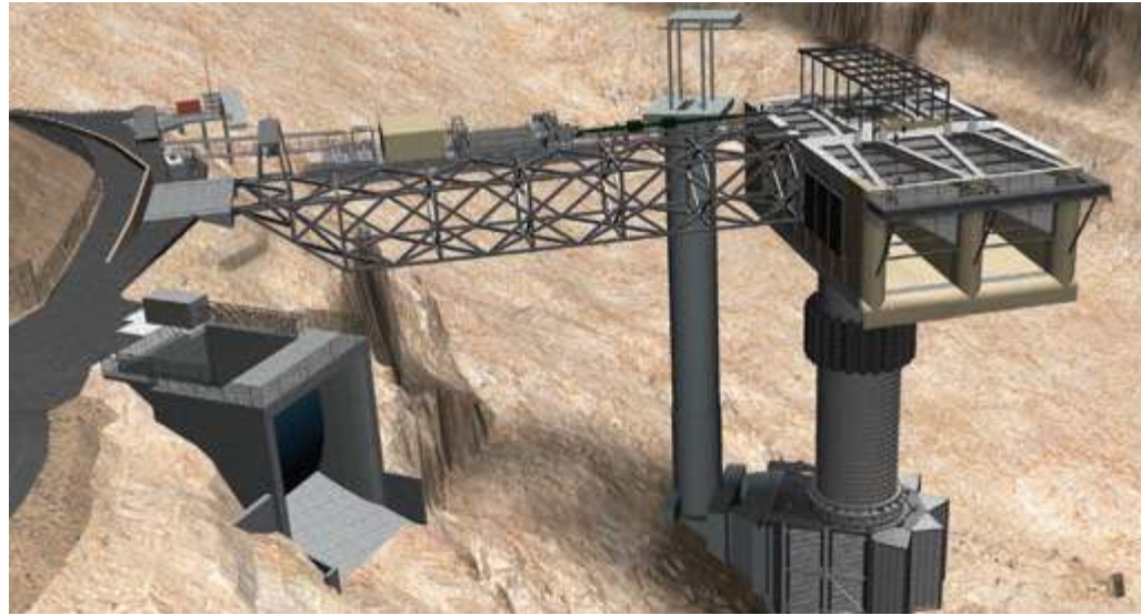
An artist's rendering depicts the fisheries enhancement project to be built above Round Butte Dam.

The withdrawal structure will provide a surface current to attract and collect migrating fish. The fish will be collected, sorted and taken down-