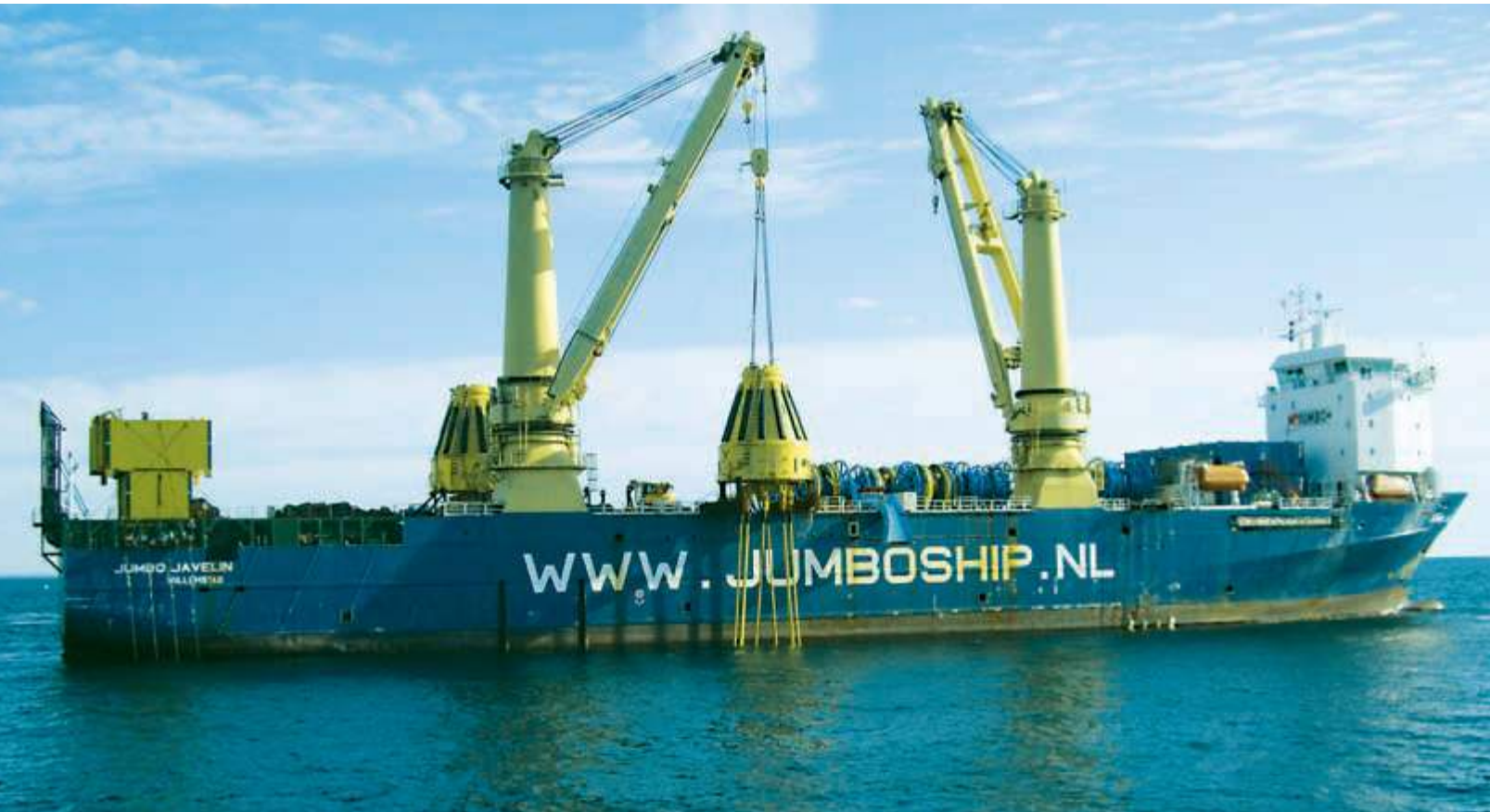
A subsurface buoy, to which LNG tankers will link and offload their cargo, is lowered from a heavy-lift ship into the Atlantic Ocean near Boston.

Foss subsidiary Constellation Maritime, making important in-roads into the LNG terminal construction business, safely and successfully assisted recently with completion of an offshore transfer facility that will be a major conduit for natural gas destined for Massachusetts and New England.