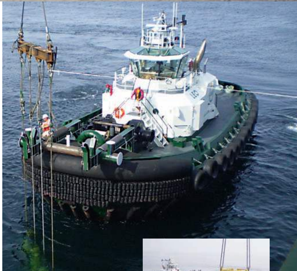
A beam attached to four anchor wires is lowered toward a framework built on the bow of the Dolphin-Class tug Leo .