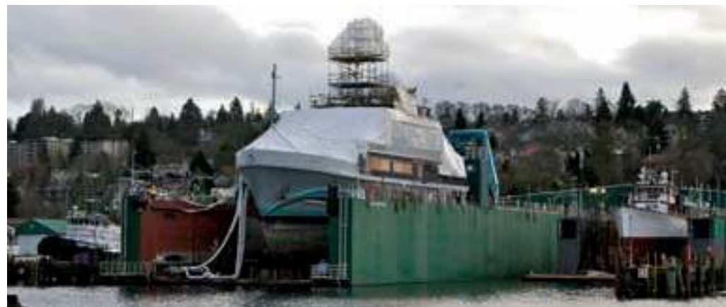
The Alucia , center, dwarfs the Stacey Foss , left, and the yacht Thea Foss .

Air France Flight 447 plunged into the South Atlantic in June 2009, killing all 228 people on board. The Alucia's effort to find the plane, financed by Air France and Airbus, was the fourth attempt to find the jetliner.