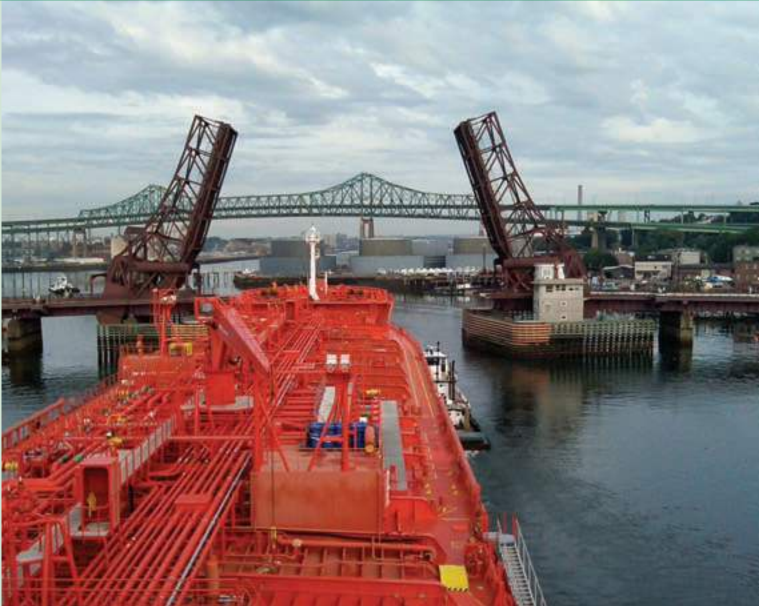
After the passage through the Chelsea Street Bridge, the channel through the Andrew P. McArdle Bridge looks like a wide one.

The Andrew P. McArdle Bridge is the first obstacle one encounters upon entering the creek. It is a bascule bridge that opens on demand with a horizontal clearance of 175 feet. The biggest ships that transit are no larger than 106 foot beam and 800 feet in length, but with a tug traditionally tied alongside the port bow to control the ship, the clearance during passage can be as little as 20 feet on either side.