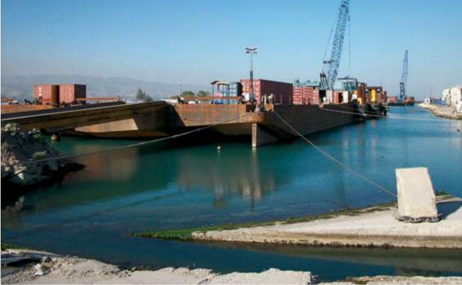
The barges Heavy Lifter , foreground, and Columbia Boston on station in Port-au-Prince, Haiti.