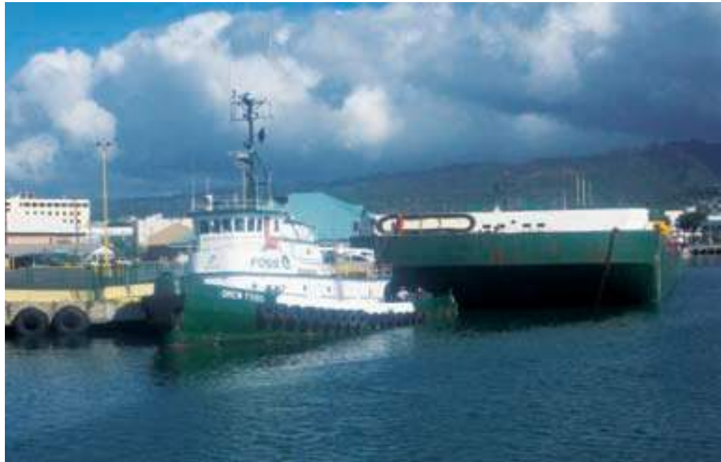
The Drew Foss departed Honolulu for Kwajalein Island in January.

From there, the tug and barge headed to Singapore (4,000 miles) to pick up cargo for shoreline