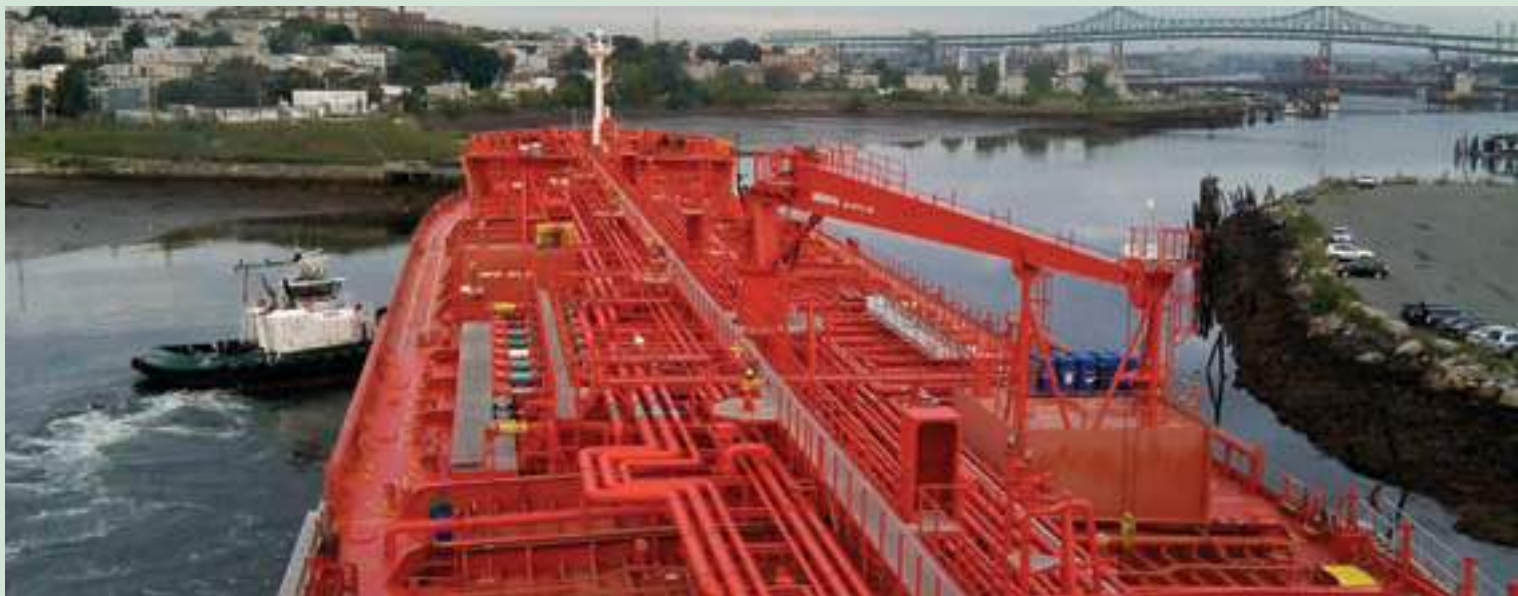
The tractor tug Leo helps the tanker around Cabot's Corner.