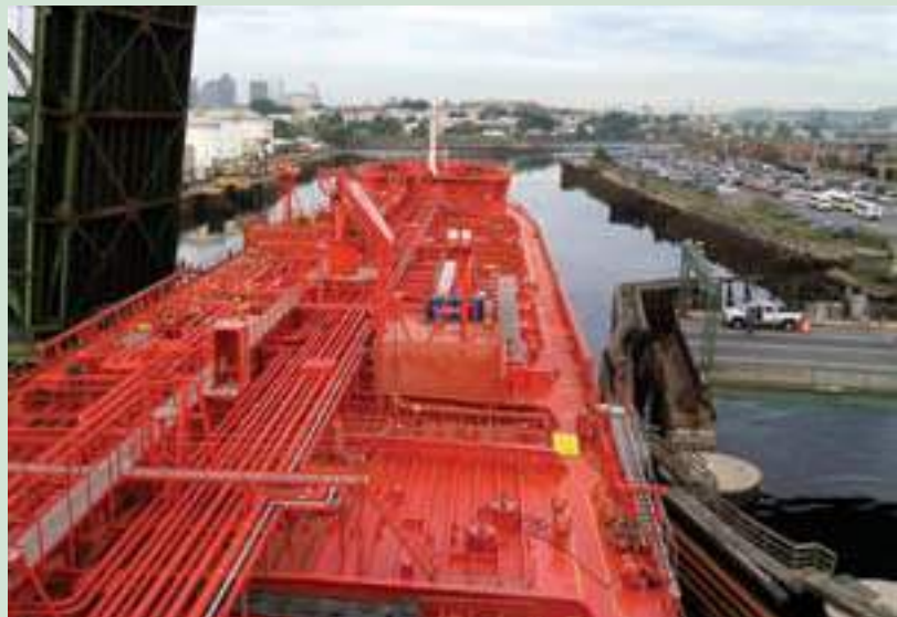
The outbound " Boston Beam " tanker squeezes its way through the Chelsea Street Bridge.