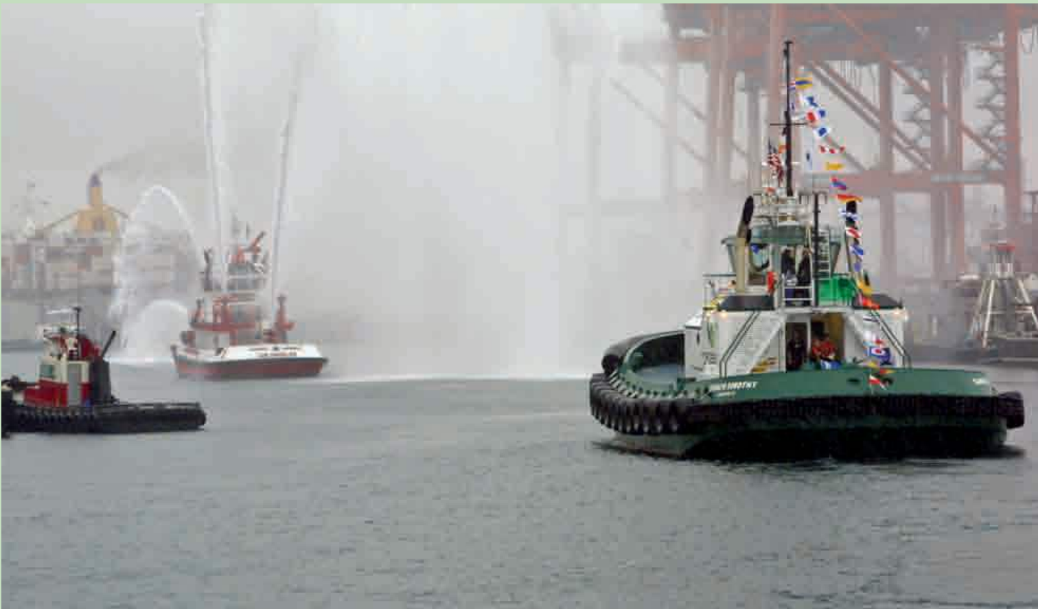
A Los Angeles fireboat gives the Carolyn Dorothy a water-cannon salute after the unveiling in Long Beach.