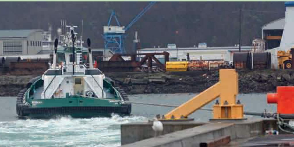
During a bollard-pull test on Jan. 6 in Tacoma, the Carolyn Dorothy's pulling power proved to be in the same range as its diesel-powered sisters.