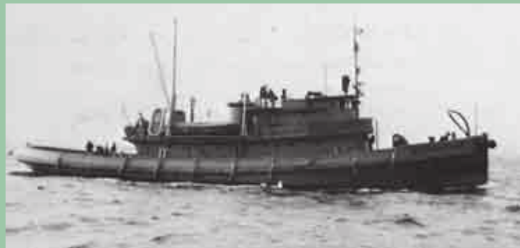
The ex-Army tug LT-215 , delivered by Foss to China in 1946, was a miki-miki class boat, like the one in the photo above.

The tug and the remaining two barges remained at anchor off