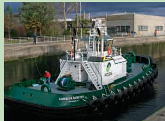
Right: The Hybrid Dolphin tug passes through the Hiram Chittenden Locks in Seattle on the way to Foss headquarters in early January.