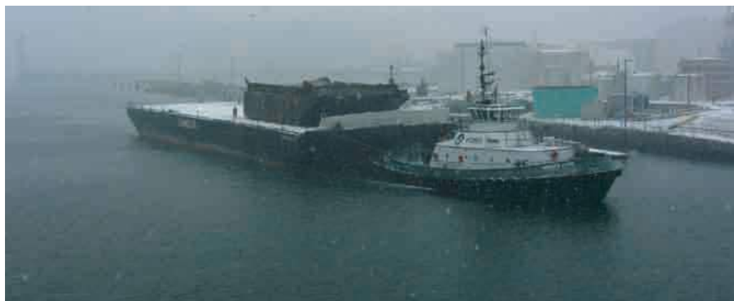
The Andrew Foss tows a barge carrying the remnants of the BMC 33 after it was salvaged from Tacoma's Hylebos Waterway.