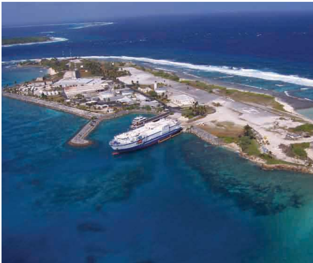
The Delta Mariner at the pier on tiny Meck Island in the Western Pacific.

The government's original plan was to transload the cargo from the Delta Mariner to a barge at Kwajalein Island and then tow it 20 miles to its final destination, Meck Island. But a Gulf Caribe official arrived in the Islands ahead of the ship, flew by helicopter to Meck and determined that the Delta