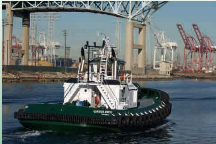
The Carolyn Dorothy arrives in Long Beach

The company also has converted all of its tugs to ultra-low sulfur diesel fuel, even though