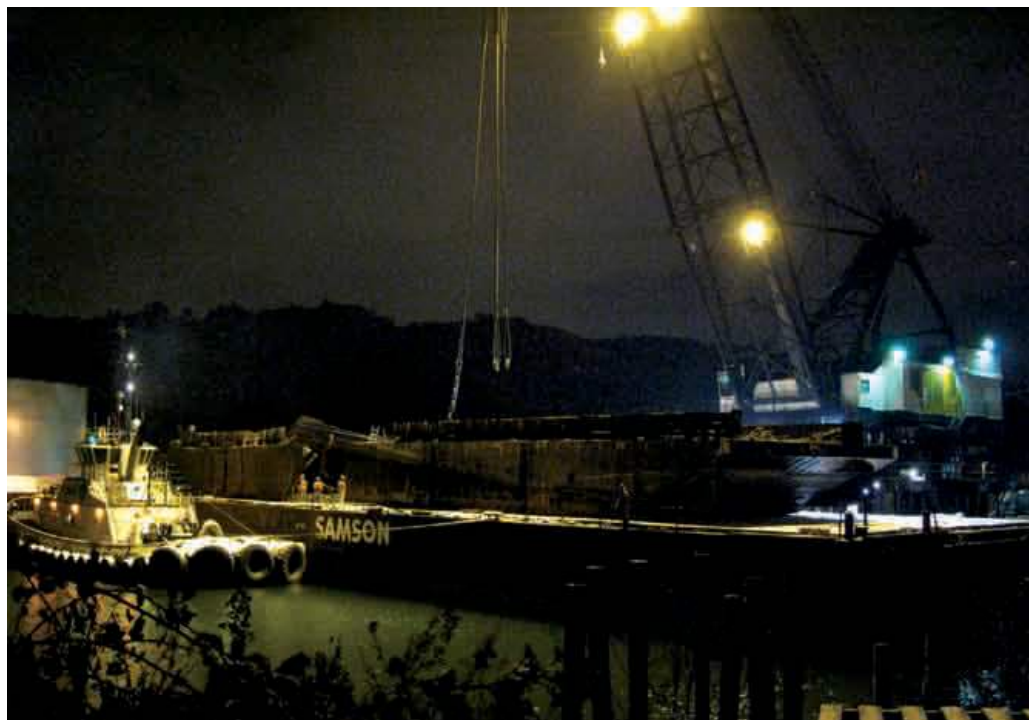
The Andrew Foss assists after the second of two pieces of a derelict barge was salvaged from Tacoma's Hylebos Waterway on Christmas Eve.

The barge was cut up and delivered to Schnitzer Steel for scrapping.