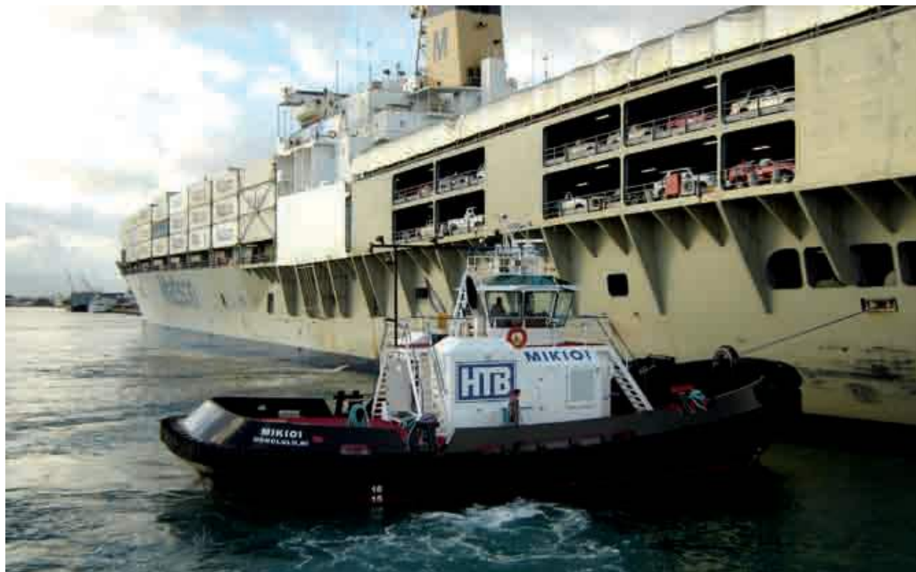
The Dolphin-Class tug Mikioi , the first built at Foss Rainier Shipyard, was assigned to Hawaiian Tug and Barge and is shown here assisting a Matson ship in Honolulu harbor.

Hawaiian Tug and Barge (HTB) performs ship assists and other harbor work in the Port of Honolulu and ports of the neighbor islands. Young Brothers Ltd. (YB) is a tug-barge operation that uses tow wire to move marine cargo between Honolulu and the neighbor islands through a hub-and-spoke system. The cargo operation runs on a set weekly schedule and is regulated by the state Public Utilities Commission. Hawaiian Tug and Barge/Young Brothers is operated as a single company with two distinct lines of businesses. The companies were acquired by Saltchuk Resources in 1999 and are now part of its tug-barge holding company, Marine Resources Group (MRG). Foss Maritime also is part of MRG.