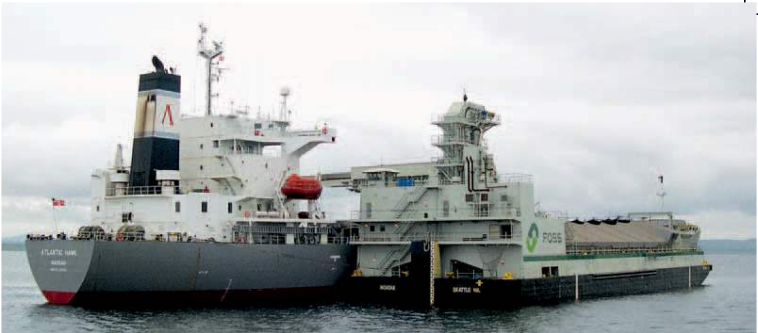
The Foss barge Noatak lighters ore to a ship near the Red Dog Mine port.