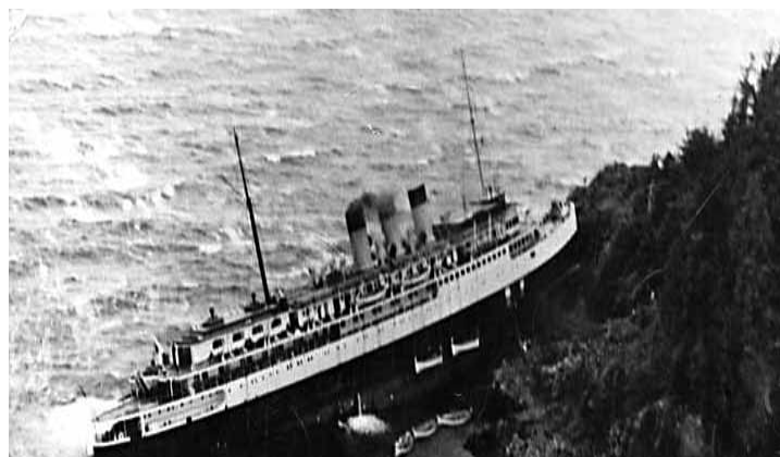
The Princess Kathleen on the rocks, before sliding into the depths off Point Lena.