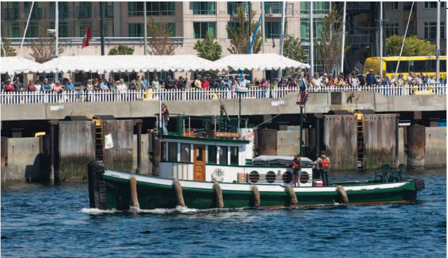
Don Wilson Port of Seattle photos