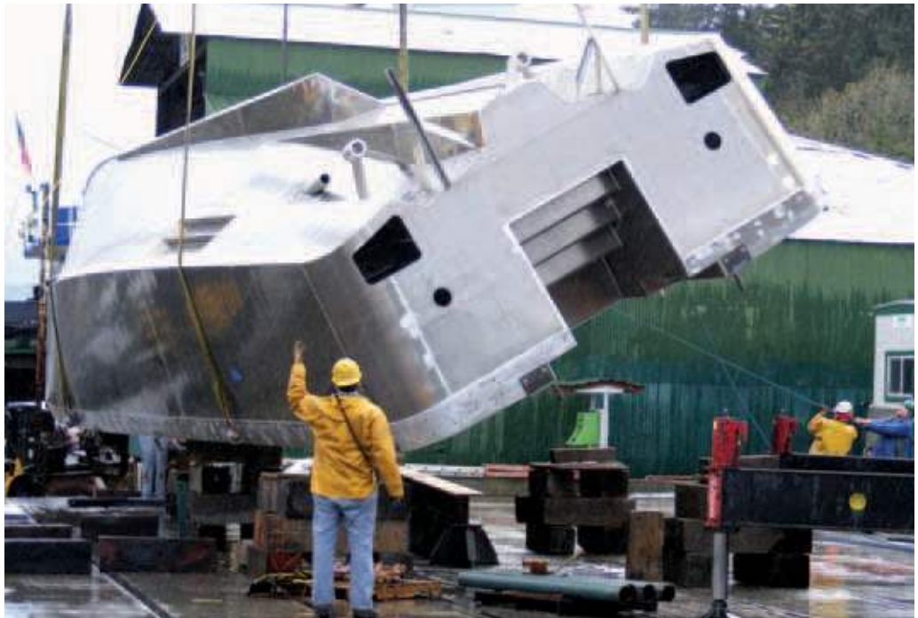
Cranes flipped the hull of the Ava Foss to an upright position on April 6 at Foss Rainier Shipyard.