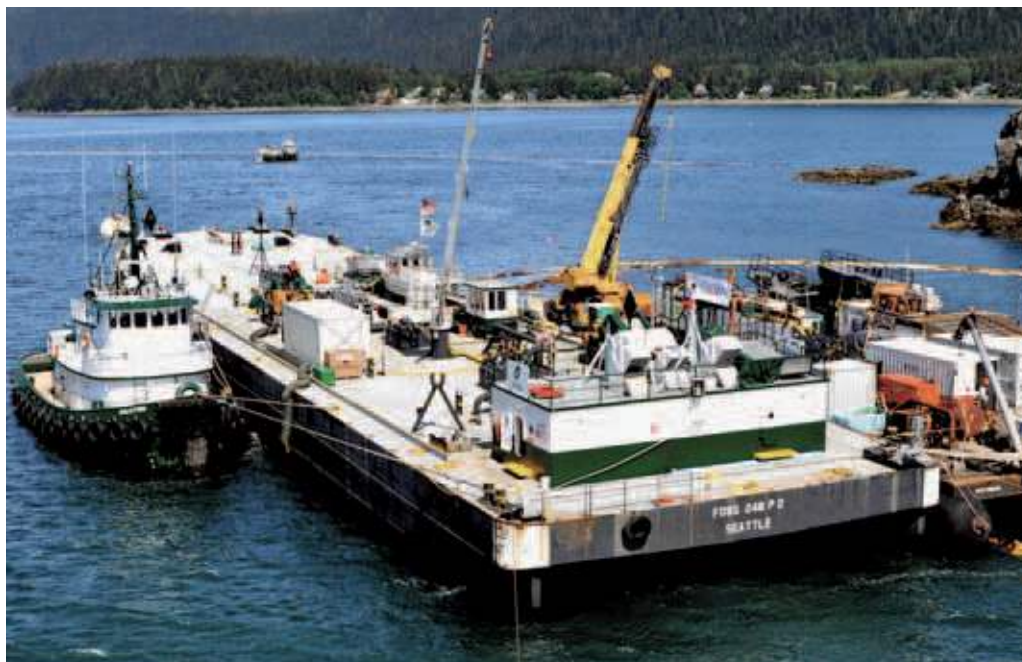
The Halle Foss and the tankbarge 248 P-2 on the job over the wreck of the Princess Kathleen .