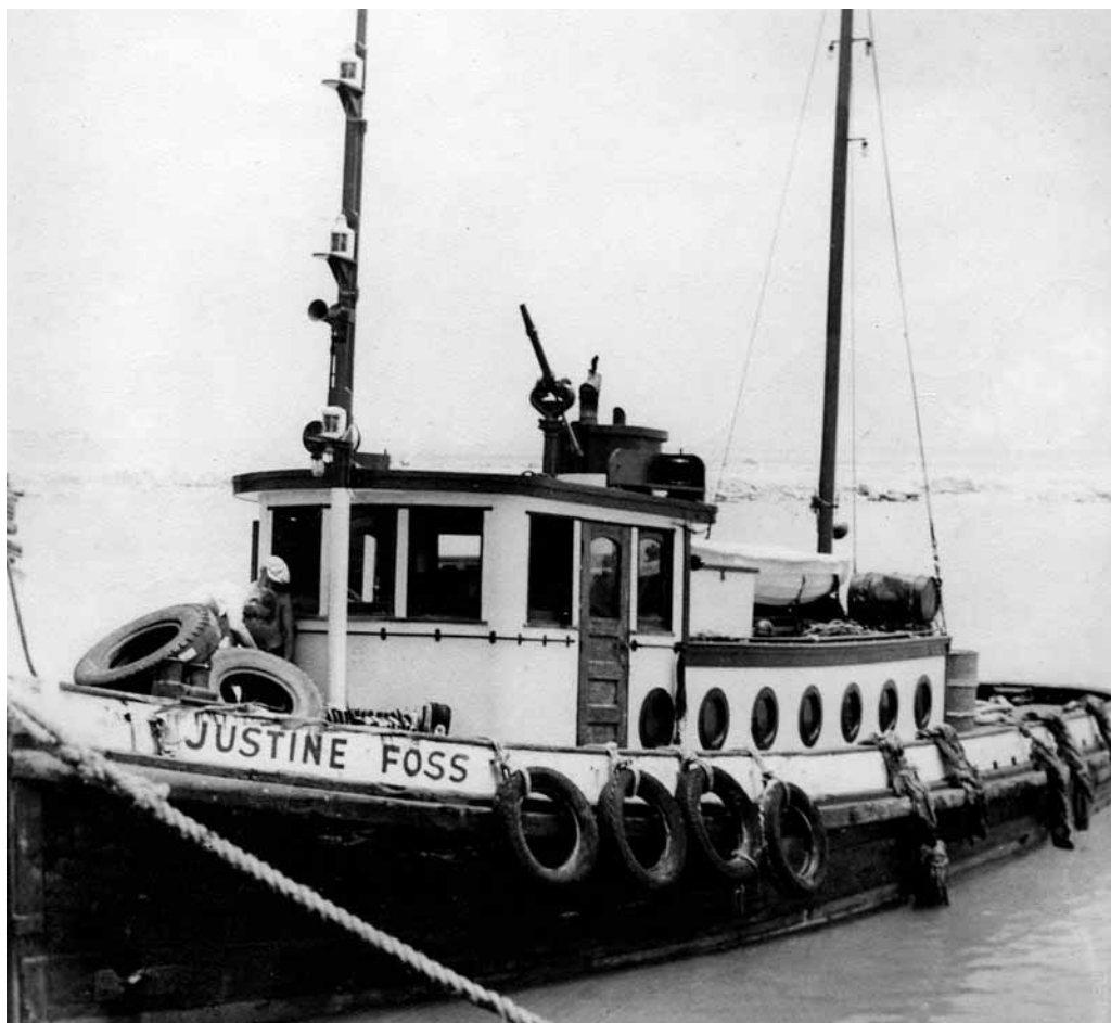
The Justine Foss moored at Wake Island in 1941.