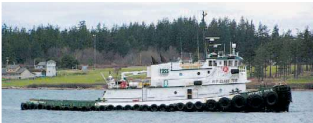
The Jeffrey Foss will be on station at Neah Bay beginning in July 2010.

Beginning this July, the Jeffrey Foss will be assigned to Neah Bay. The Jeffrey is a 112-foot, 70-ton bollard pull, high-performance ocean-going tug built in 1970 at McDermott Shipyard