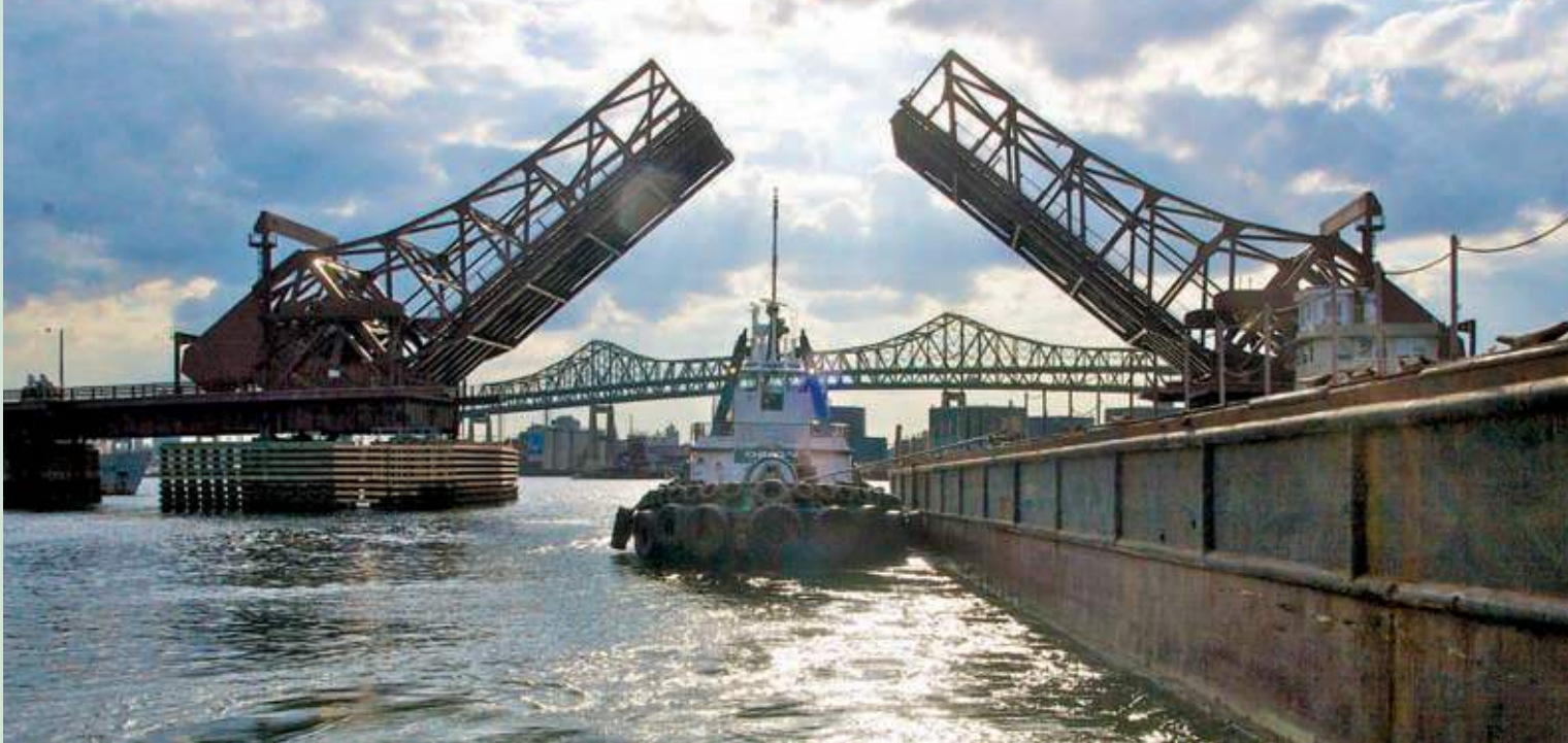
With the Orion in the lead, the barge Chem Caribe heads for the narrow opening of the Andrew McArdle Bridge at the opening of the Chelsea River.