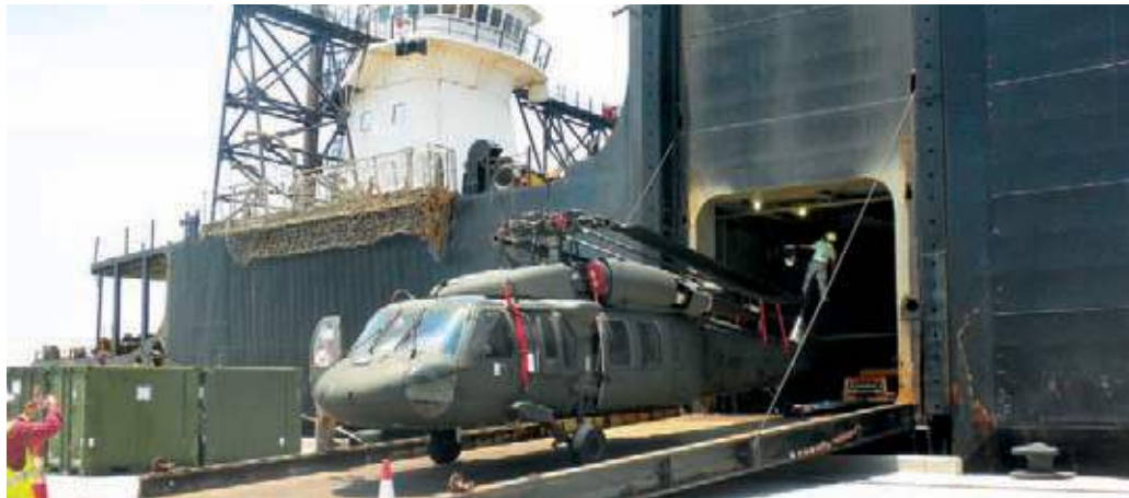
An Army UH 60 Black Hawk helicopter is loaded onto the Strong Mariner in Subic Bay, Philippines.

The Strong Mariner was in the Far East to deliver helicopters, rolling stock and ammunition from the ports of Yokohama, Naha and Tengan, Japan, to Subic Bay, Philippines, for