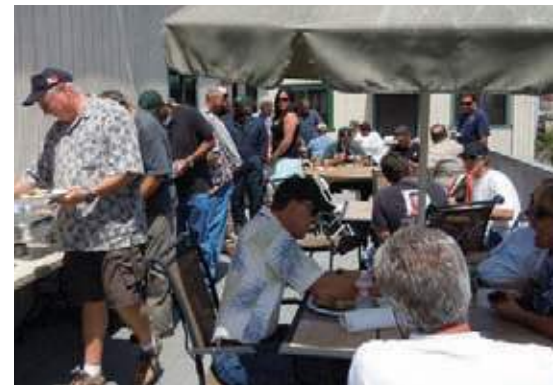
The Foss Southern California Division held a barbecue to celebrate going a full year without a lost-time injury (LTI). As of March, all divisions of Foss had gone at least a year without an LTI.

"We can be proud of what we have achieved so far, but every one of us must continue to make their own safety and that of their co-workers