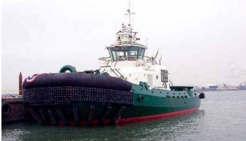
The Campbell Foss will be the world's second hybrid tugboat.

Aspin Kemp and Associates (AKA) will again provide the hybrid