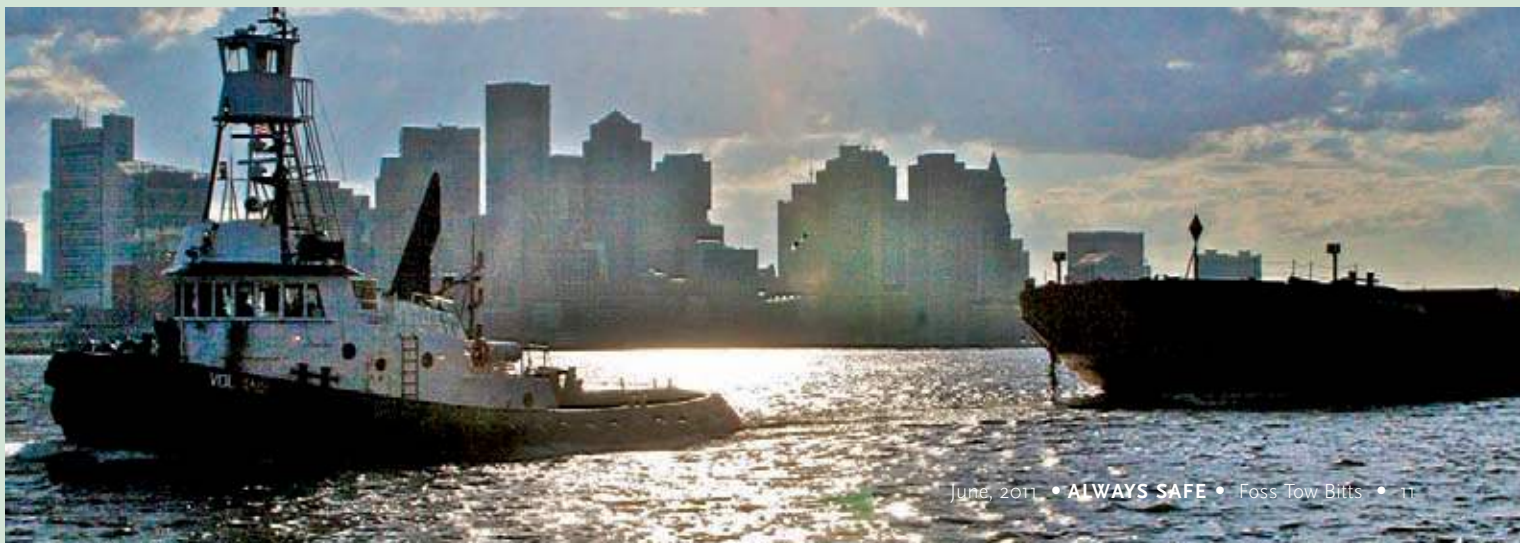
The Volans , with the Chem Caribe in tow, passes the downtown Boston skyline, heading for the open sea and Portland, Maine.