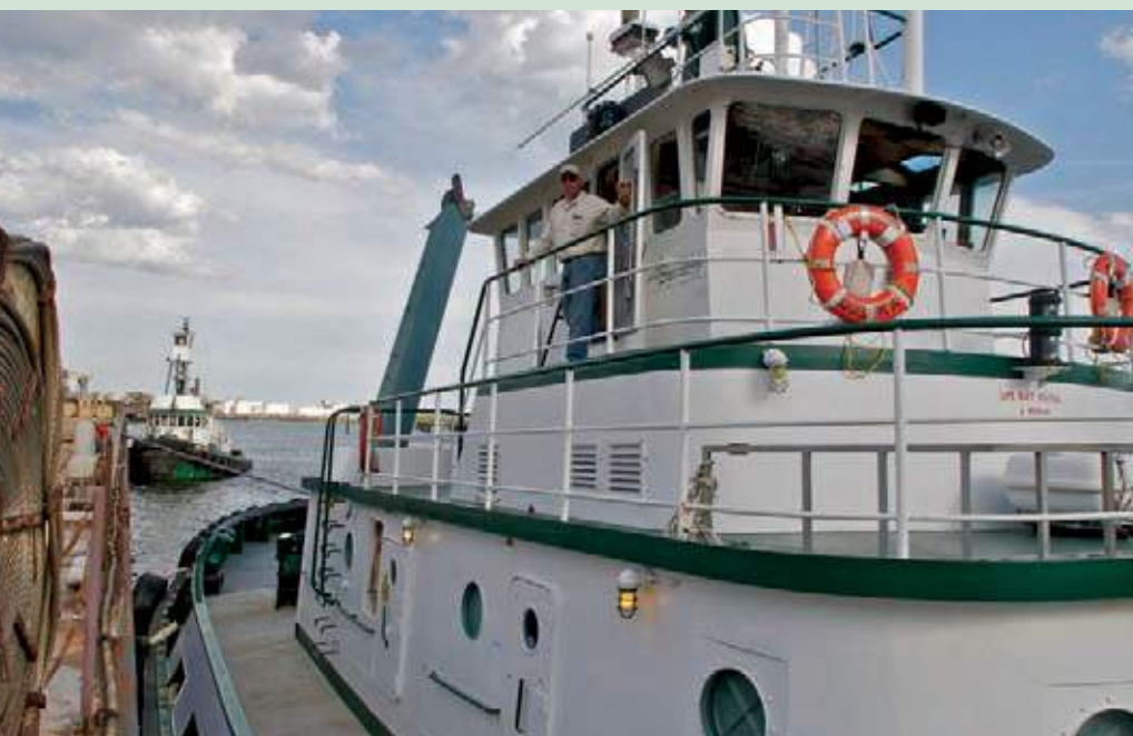
Capt. Jeff McKay , outside the pilothouse of the Orion , just before pulling the barge into the river channel.