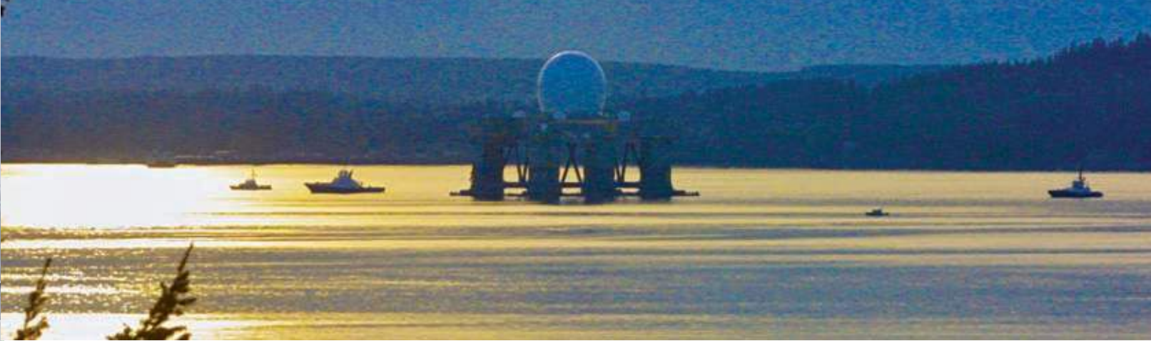
Moving southward past Kingston at sunset, the radar vessel SBX-1 was escorted by the Lindsey Foss , immediately in front of the domed structure, and the Pacific Star , following on the far right.