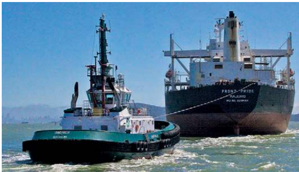
The tug America assists a tanker that has just departed Richmond Long Wharf. Its crew, and others on the Bay, have not experienced a lost-time injury in three years.

To answer their safety questions, mariners have access to a growing database Foss calls its "Job Safety Analysis Library," which eventually aims to list every task a tug crew faces and describe how to perform