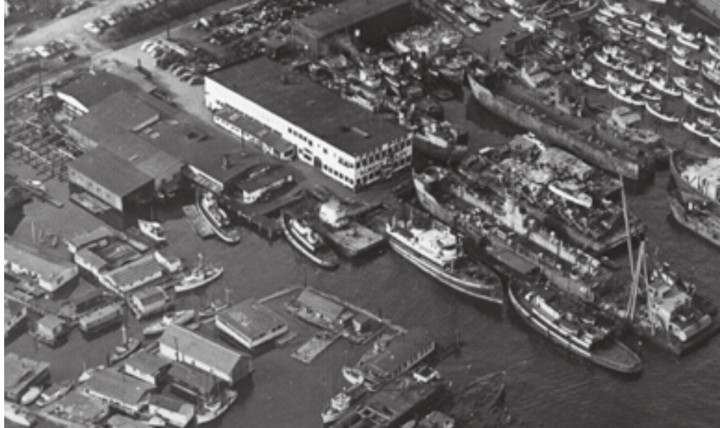
A 1949 photo of the current Foss property on Ewing St. The carpenter shop and other repair facilities are located in the buildings to the left of the white administration building. The area where the current shipyard and terminal are located was used as moorage for war surplus vessels purchased by the Foss family, as well as barge storage and public marinas. The building currently housing the Purchasing and Billing Department is also visible in its current location, just to the right of the back of the administration building.

The Tacoma operations continued to expand rapidly, with the family purchasing several more surplus tugs and barges for use in gravel, chip, oil and chemical towing. A larger facility was needed for the expanding operations, so another move was necessary—this time in 1944 to 225 East F Street on Tacoma’s Middle Waterway. This was the final location change in Tacoma, although the facilities have been upgraded over the years. The headquarters included management offices, accounting, payroll, operations, and dispatch. For the vessels, a complete store, shoreside repair facility, paint factory, a marine ways and a drydock able to handle the largest of the ocean going tugs which had been added to the fleet