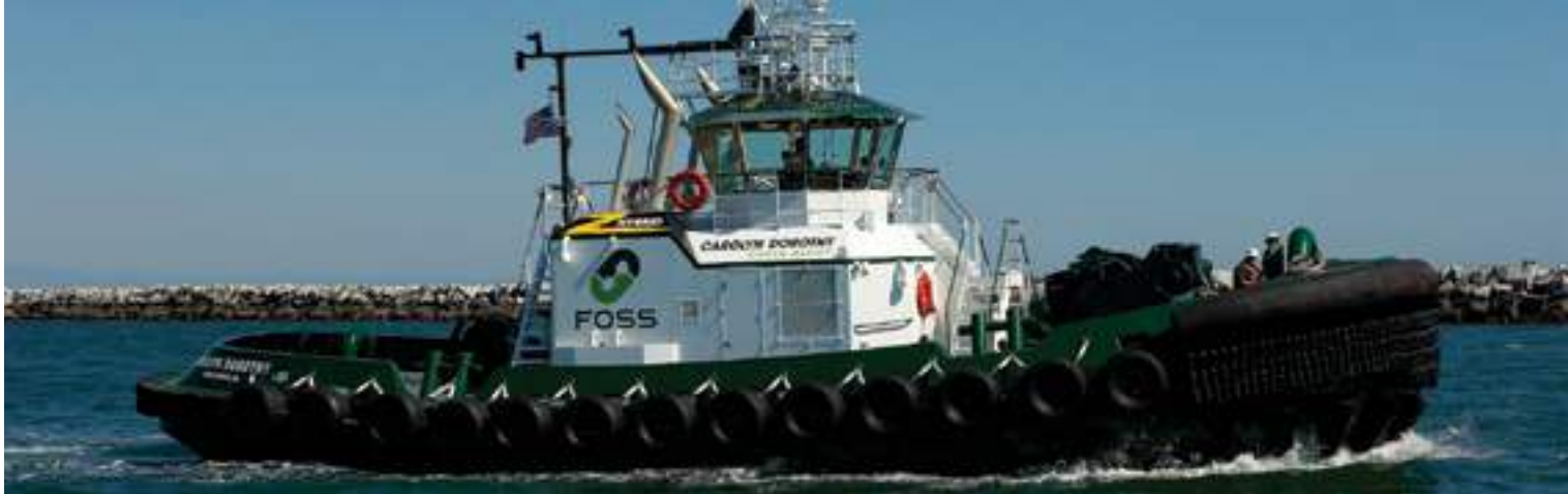
The Carolyn Dorothy is the world's first hybrid-powered tug. Foss will convert another tug to hybrid power in 2011.