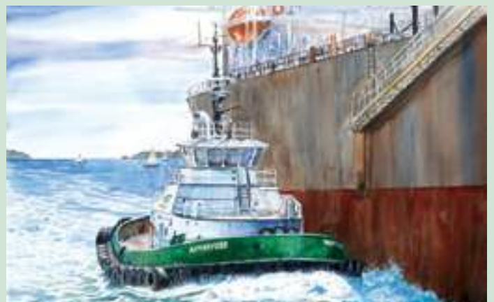
June, The Arthur Foss Assisting a Tanker on San Francisco Bay