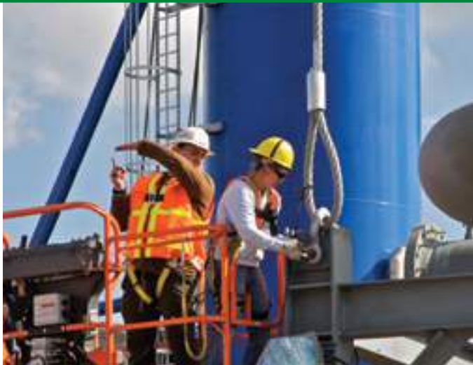
A longshoreman fixes a shackle to a module before it is lifted onto a Foss barge at the Port of Vancouver.