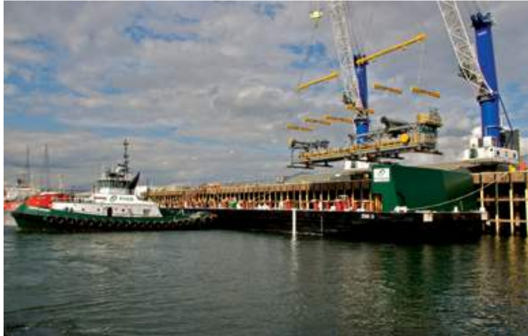
The first module is loaded on the Foss barge 286-3 at the Port of Vancouver, Wash., on Oct. 8.

"The schedule made this work very challenging," Troutman said, noting