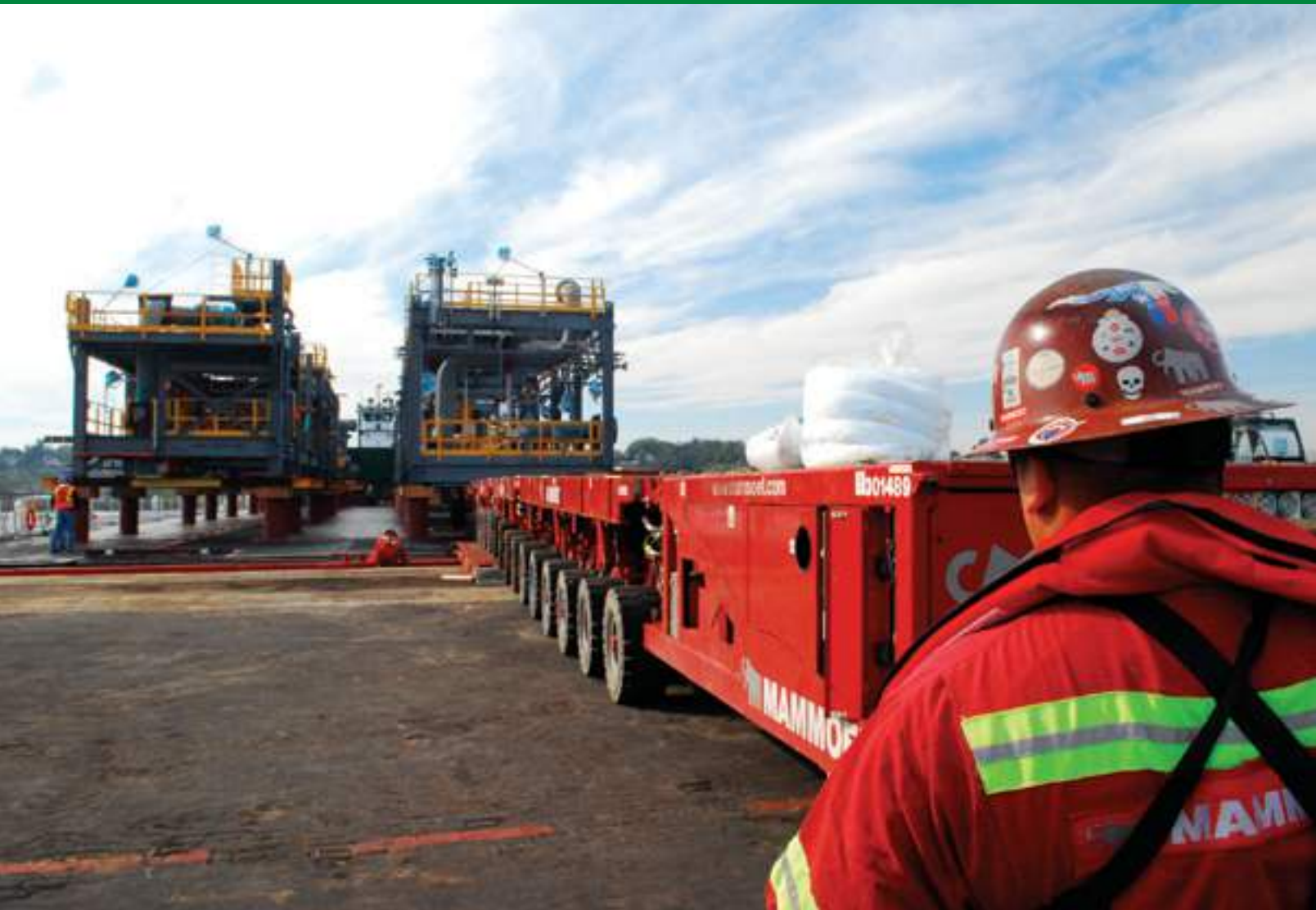
An employee of heavy-lift company Mammoet is controlling a self-propelled modular transporter (SPMT) to offload modules at the Port of Lewiston.