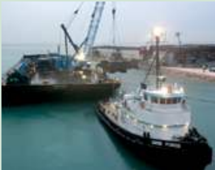
The Caribe Pioneer stands by as a lower section of the crane is hoisted onto the barge Columbia Boston .