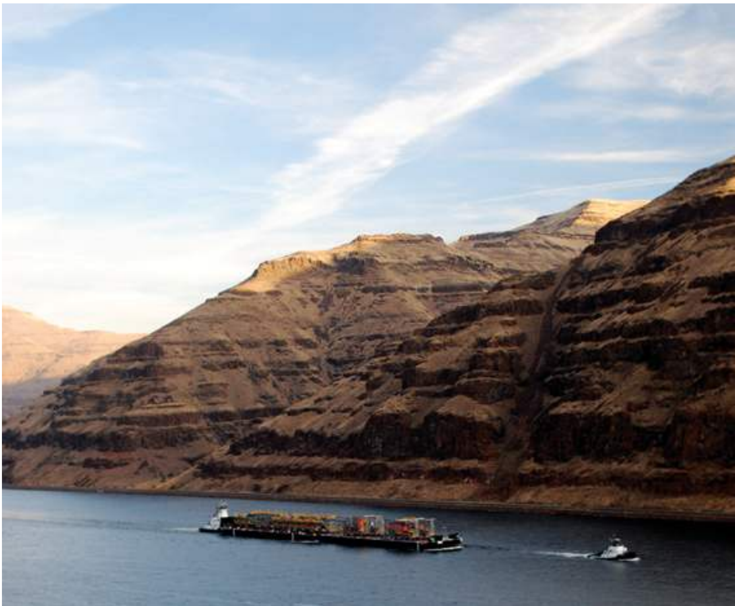
The Betsy L is in the lead and the PJ Brix is pushing the tandem barges upriver near Lewiston in the first tow of the project.