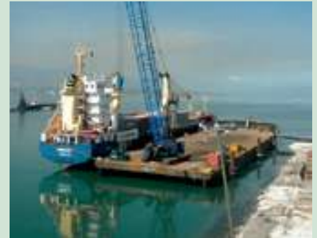
A cargo ship is alongside the newly-placed barge Columbia Boston , serving as a temporary pier in Port au Prince.