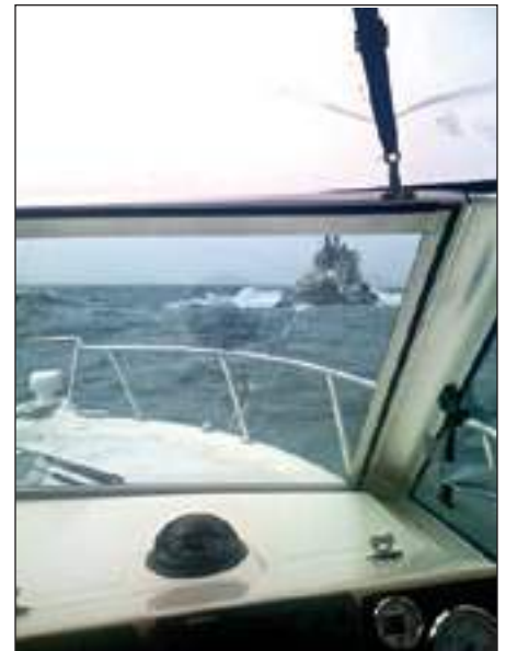
The tug Edith Foss , seen through the windshield of the Extasea .