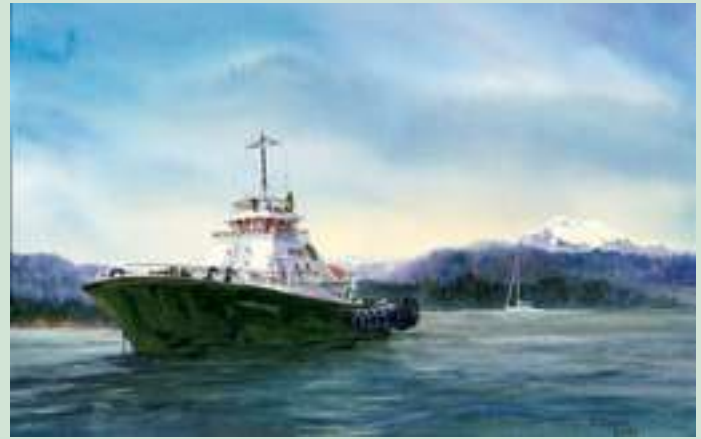
October , Awaiting Assignment - Fidalgo Bay , Julie Creighton