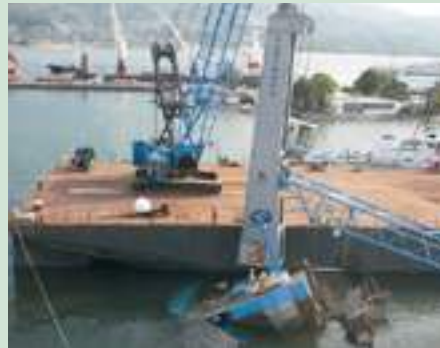
A large section of the Gottwald crane is lifted from Port au Prince harbor.