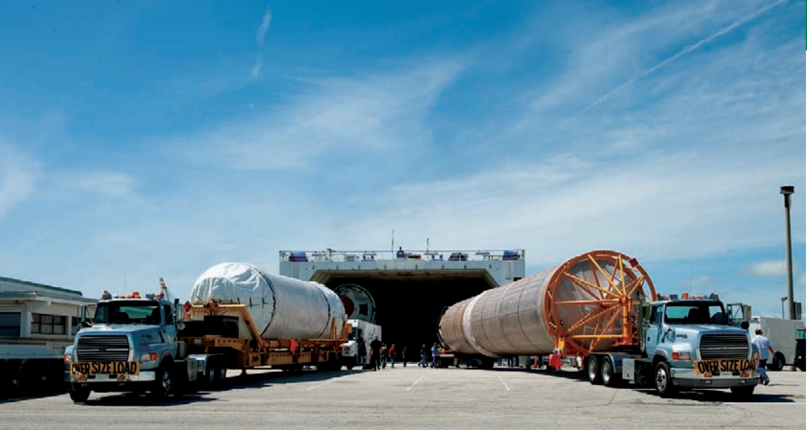
Trucks towed a Delta IV second stage, left, and an Atlas V booster from the cargo bay of the Delta Mariner at Cape Canaveral. Still on the ship is a Delta IV booster.