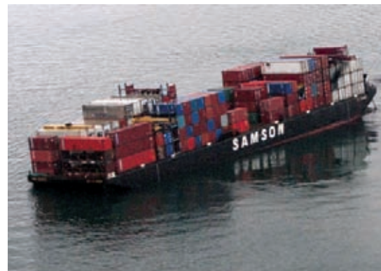
The barge St. Elias , aground on Belle Rock.

Global Diving and Salvage inspected the barge and found significant damage to one tank. On the incoming tide the barge floated free and was taken to Ship Harbor near Shannon Point for a dive survey. After Global evaluated the video from the dive survey with the Coast Guard, Foss worked collaboratively with Samson, Global and the Coast Guard and prepared a detailed transit plan to safely move