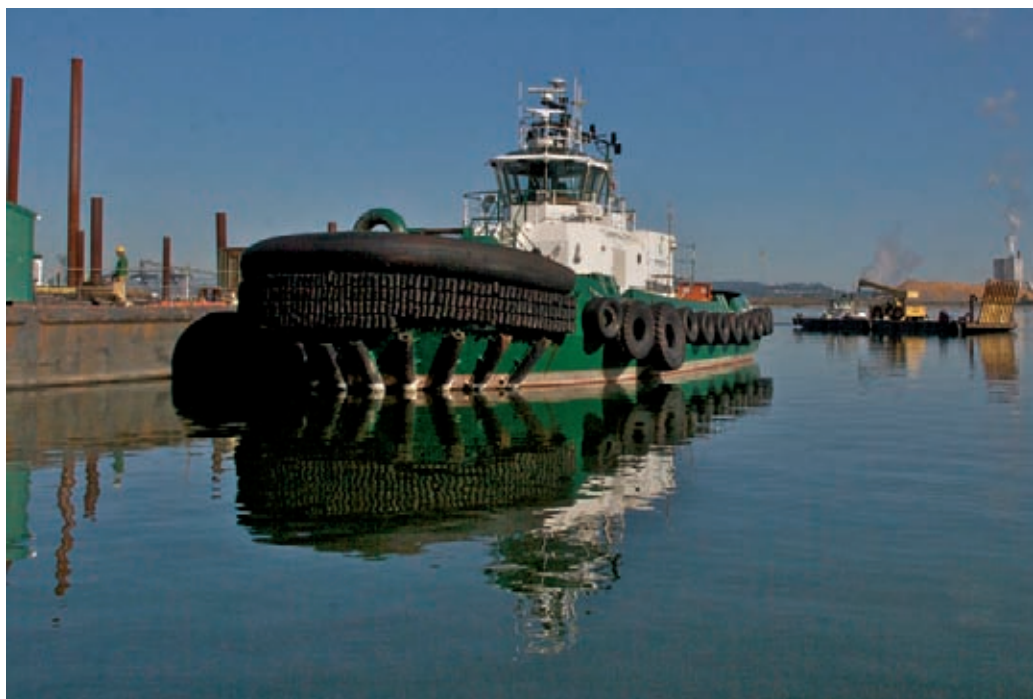
The Campbell Foss at Foss Rainier Shipyard before heading south to California. Longview, Washington is in the background, across the Columbia River.

The Campbell retains its original main diesel engines, rated at a total of 5,080 horsepower, roughly the equivalent of what the Carolyn Dorothy puts out with its main engines and motor generators combined. Consequently, Foss installed less powerful motor generators in the Campbell , rated at 500 kilowatts compared to the Carolyn Dorothy ’s one megawatt.