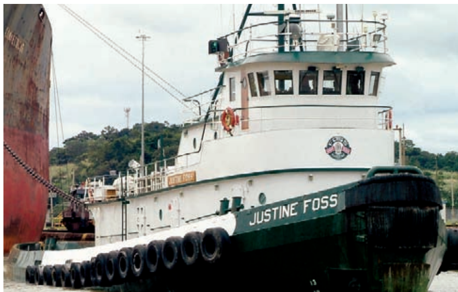
After snagging the “pigtail” chain on the tow bridle of the Brusco Barge 250, the Justine Foss , shown here in a file photo, towed the barge across the Columbia Bar to safety.

The Brusco 250 , a chip barge that was empty at the time of the incident, broke free after its tug, the Triton , experienced a tow winch failure,