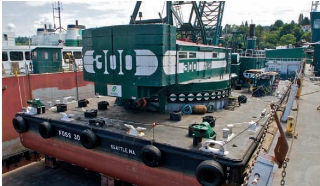
The Foss 300 derrick in drydock at Foss Shipyard in Seattle.

Workers blocked up the barge about six feet off the dry dock floor, just high enough for the wheeled tug to drive the plates into position. Then the plates were jacked up and welded into the barge hull. A conventional forklift's masts would be too high to fit