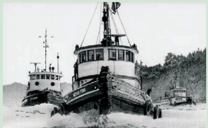
December , Byron Birdsall, Aurthur & Friends Out to Help