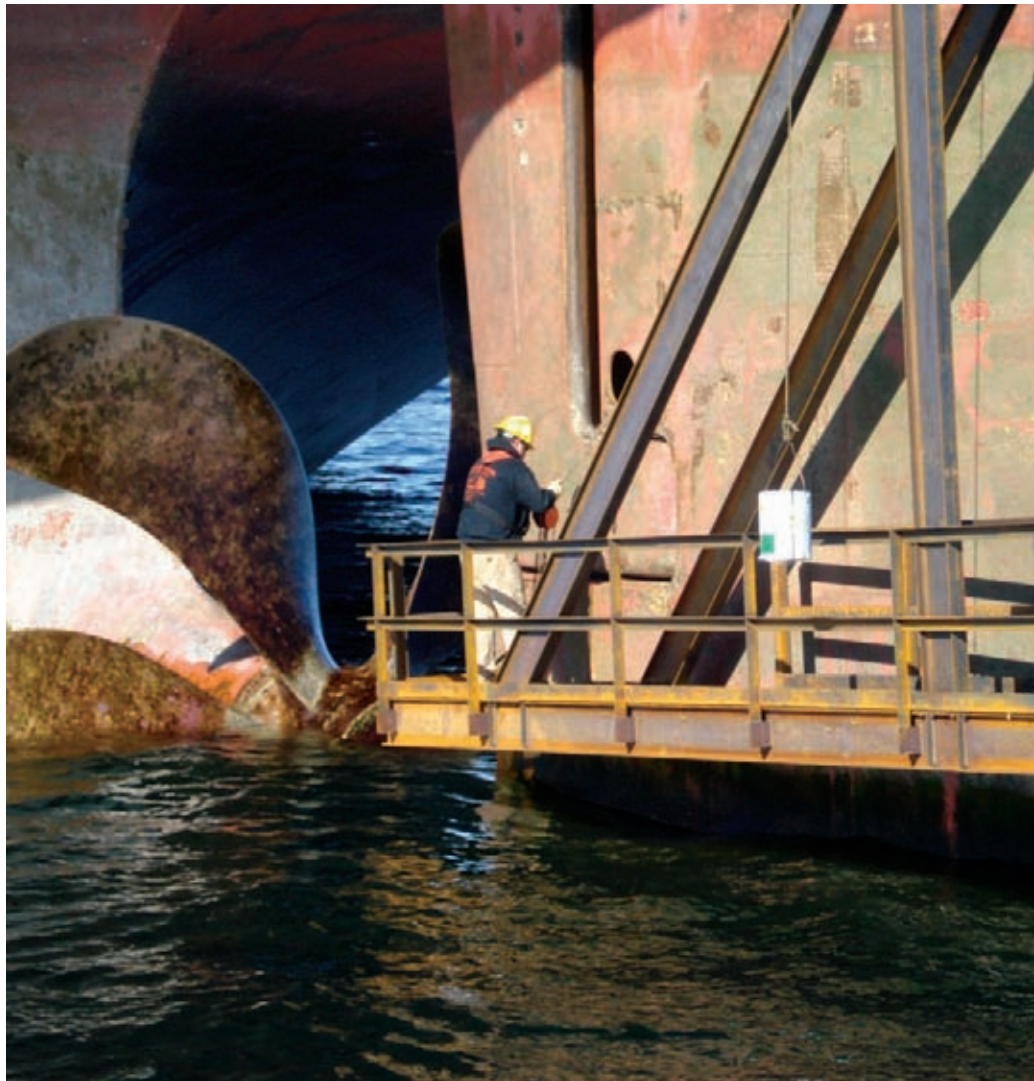
Jason Yearance of Foss works on the scaffolding used by a crew from Hyundai to repair a rudder bearing on the LNG tanker. Two members of the Hyundai crew crawled through the hole in the rudder to repair the bearing.

"Our goal was to dampen the effect of swell while transferring the load between two vastly different vessels,"